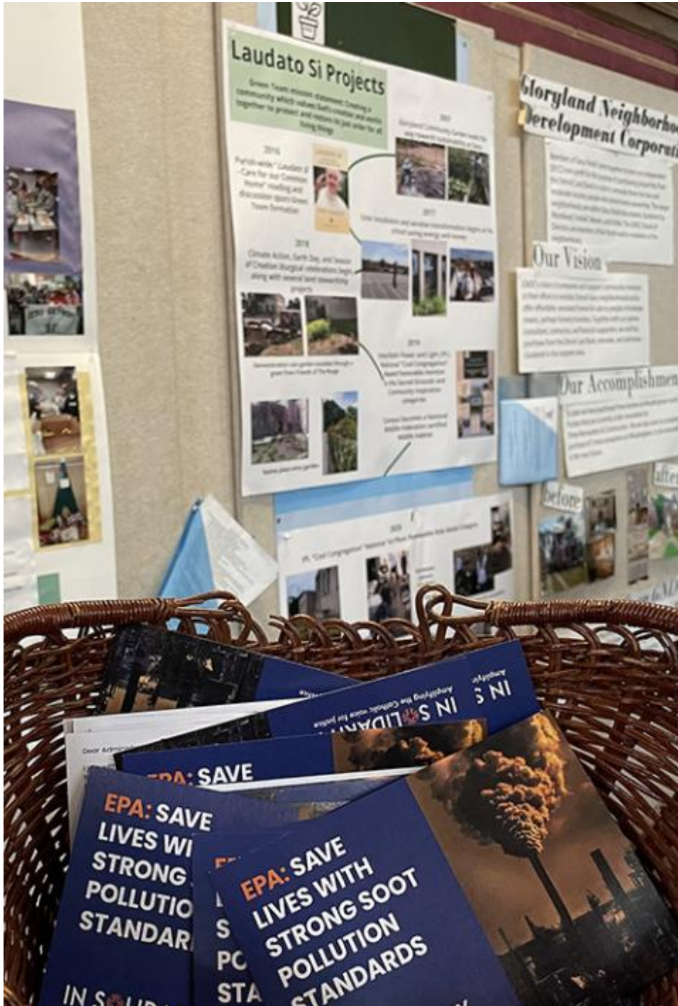
Postcards urging the EPA to lower allowable soot pollution standards are collected at the March 21 event at Gesu Catholic Church in Detroit.