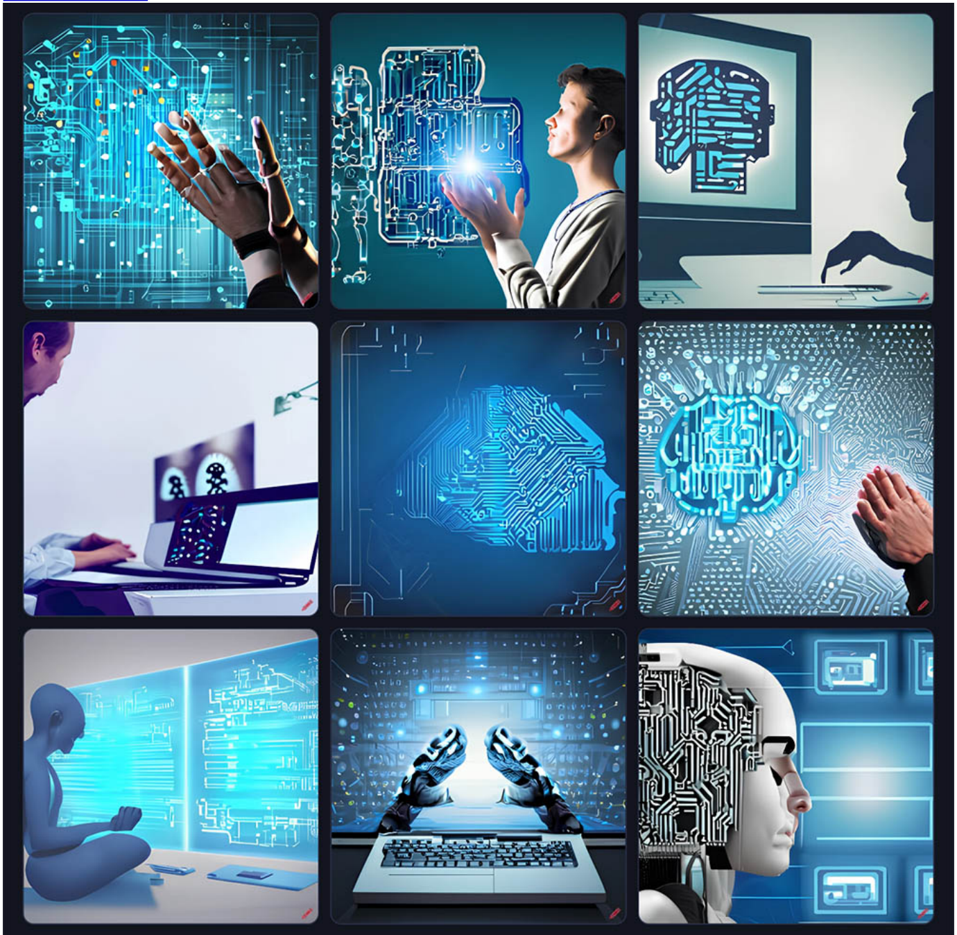
AI images generated from the prompt "a computer praying about artificial intelligence" (Craiyon)