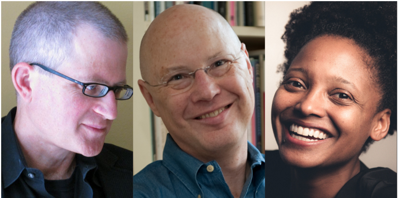
From left: Christian Wiman ; Andrew Hudgins ; Tracy K. Smith

Christian Wiman 's (1966) "Prologue" admits his own struggle with powerful humility: "I need a space for unbelief to breathe. / I need a form for failure, since it is what I have."