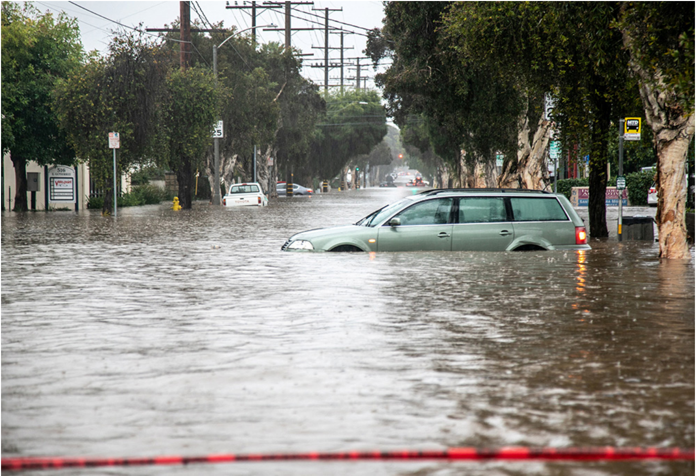
Abandoned cars are seen in a flooded street Jan. 9 in east Santa Barbara, California.