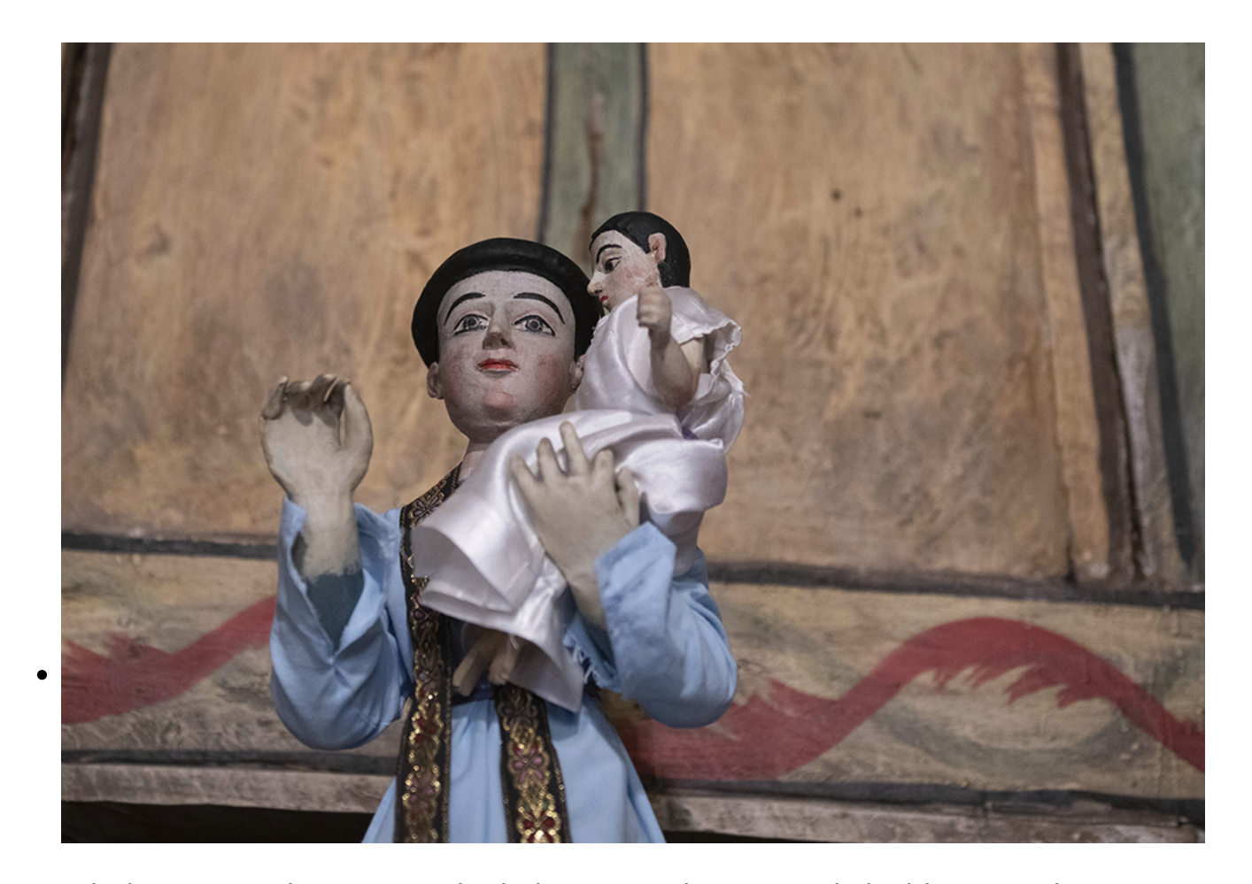
A bulto, or wooden statue, depicting St. Anthony stands inside St. Anthony's Catholic Church, April 14 in Cordova, New Mexico.