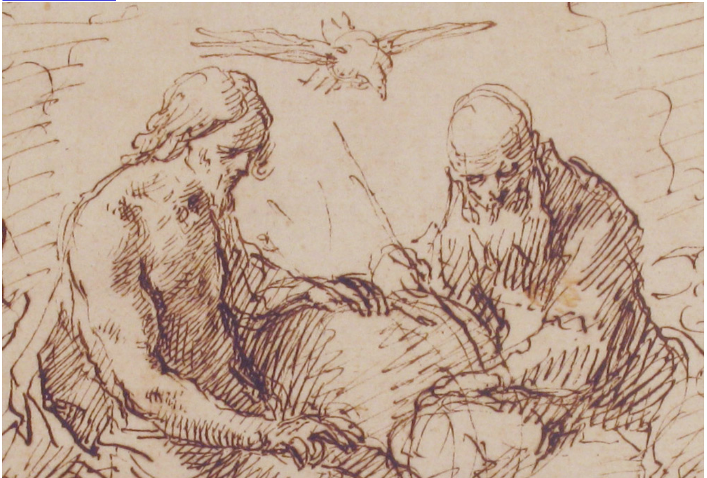
"The Holy Trinity in Glory" (detail), a 17th-century ink drawing by Italian artist Simone Cantarini (Metropolitan Museum of Art)