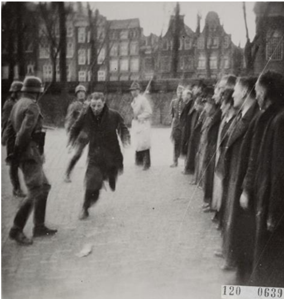
German police round up Jewish men at Jonas Daniël Meijerplein, a square in Amsterdam, in February 1941.