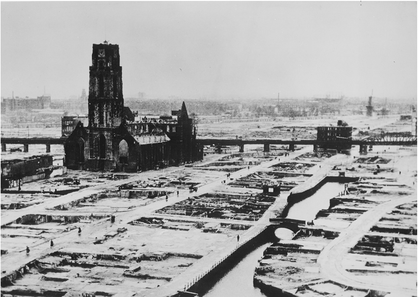
The city of Rotterdam, the Netherlands, after German bombardement in 1940

The personal is important here — but so is the greater, wider context of wartime (and postwar) Dutch history.