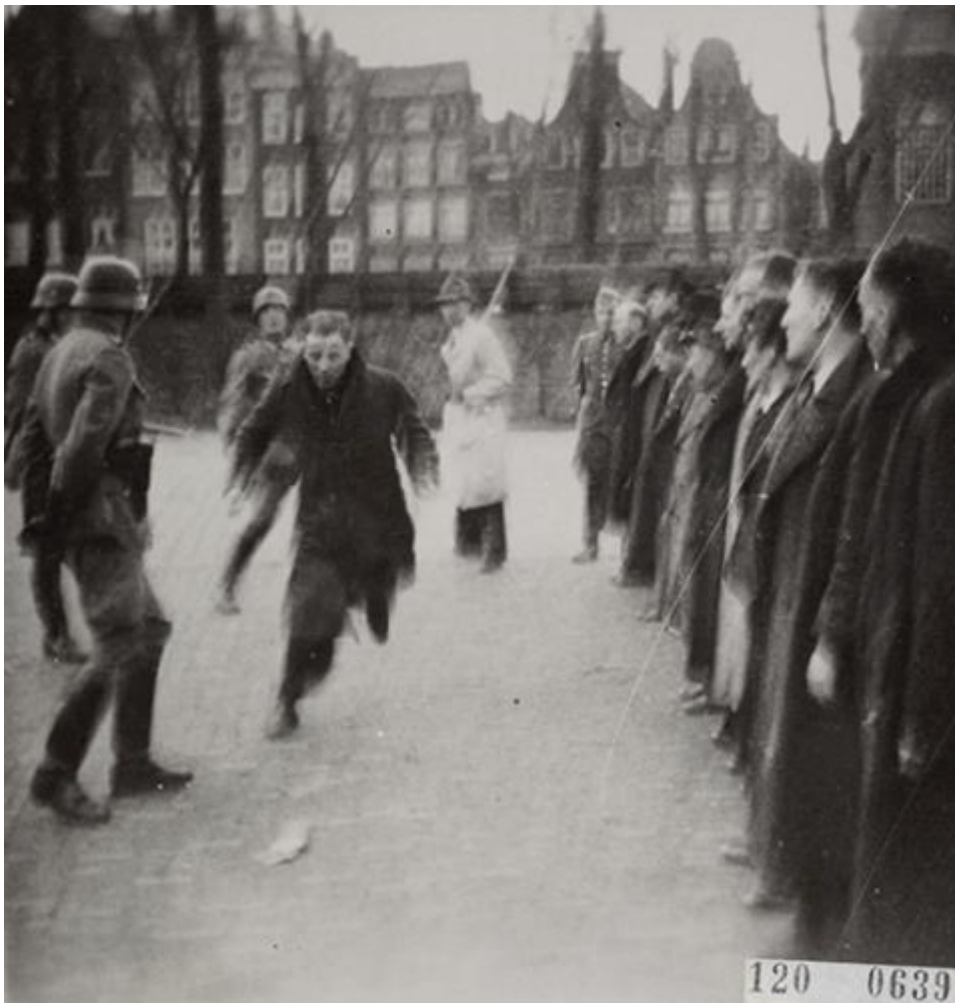
German police round up Jewish men at Jonas Daniël Meijerplein, a square in Amsterdam, in February 1941.