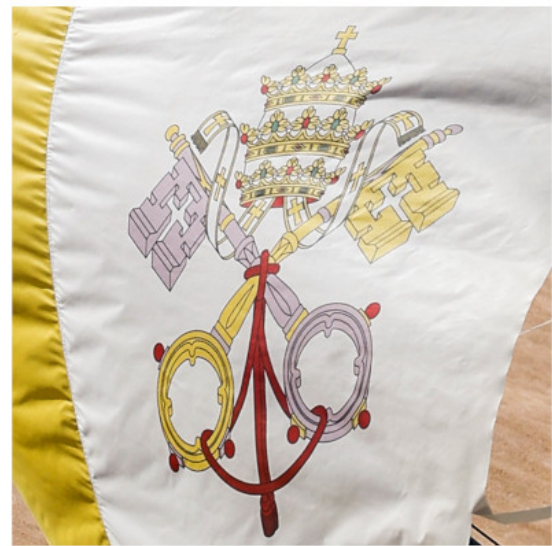
Vatican City flag at a Vatican-owned building

A variety of versions of the Vatican City flag are seen around Rome. Clockwise from the upper left, this graphic features the official version published in 2000 and again May 13, 2023; a version sold in a souvenir shop near the Vatican; the flag flying on the Jesuit headquarters; and the flag flying on a Vatican office building on Via della Conciliazione. Some of the images have been rotated to make comparisons easier.