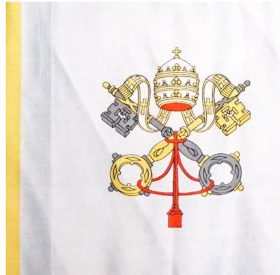
Vatican City flag at a souvenir shop