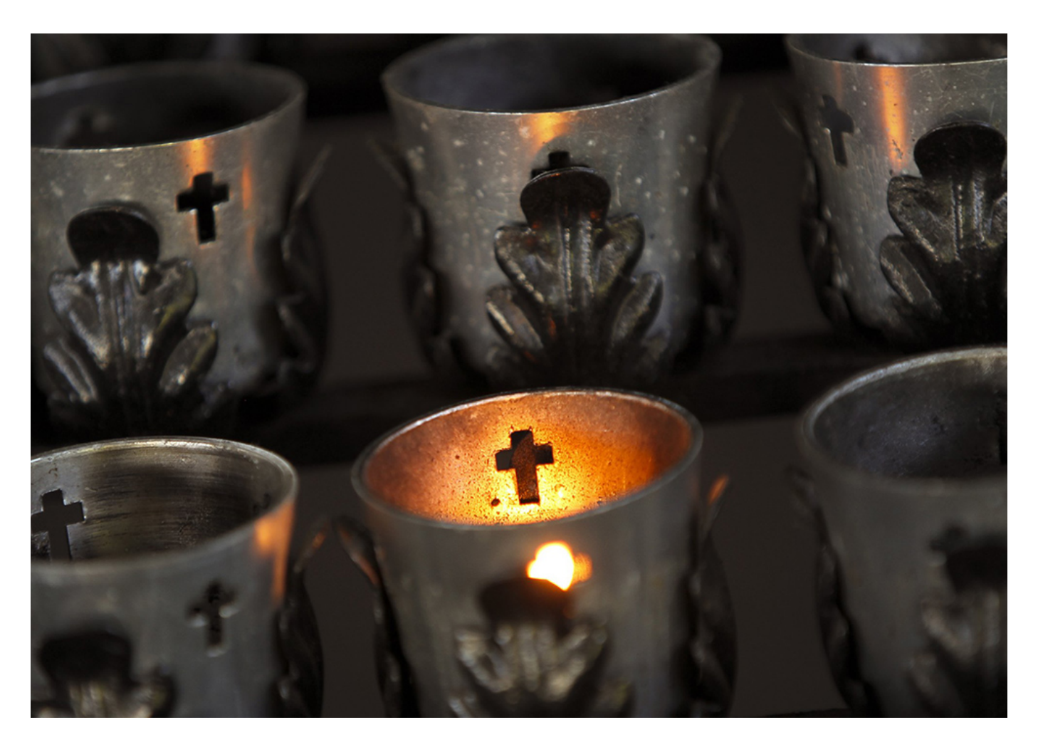
Pictured are votive candles at the St. Kateri Tekakwitha shrine in Fonda, New York.

Kateri and Indigenous cultures teach us that we don't always need more and new technology to solve our current climate problems. The passing down of knowledge from countless generations is key to living in harmony with the land beneath our feet. Even if you have not lived in one place for generations, you can draw inspiration from Indigenous peoples by learning as much as possible about the land you now inhabit.