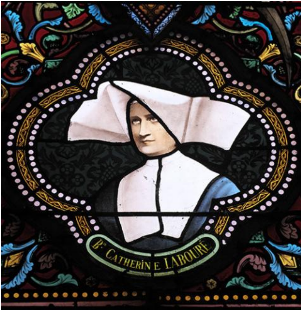
St. Catherine Labouré is depicted in stained glass at Sacred Heart Church in Moulins, France.

On Nov. 27, 1830, the Blessed Virgin had appeared to Labouré in the chapel. After a while, an oval formed around the apparition and Labouré could see this invocation: "O Mary conceived without sin, pray for those who have recourse to you"