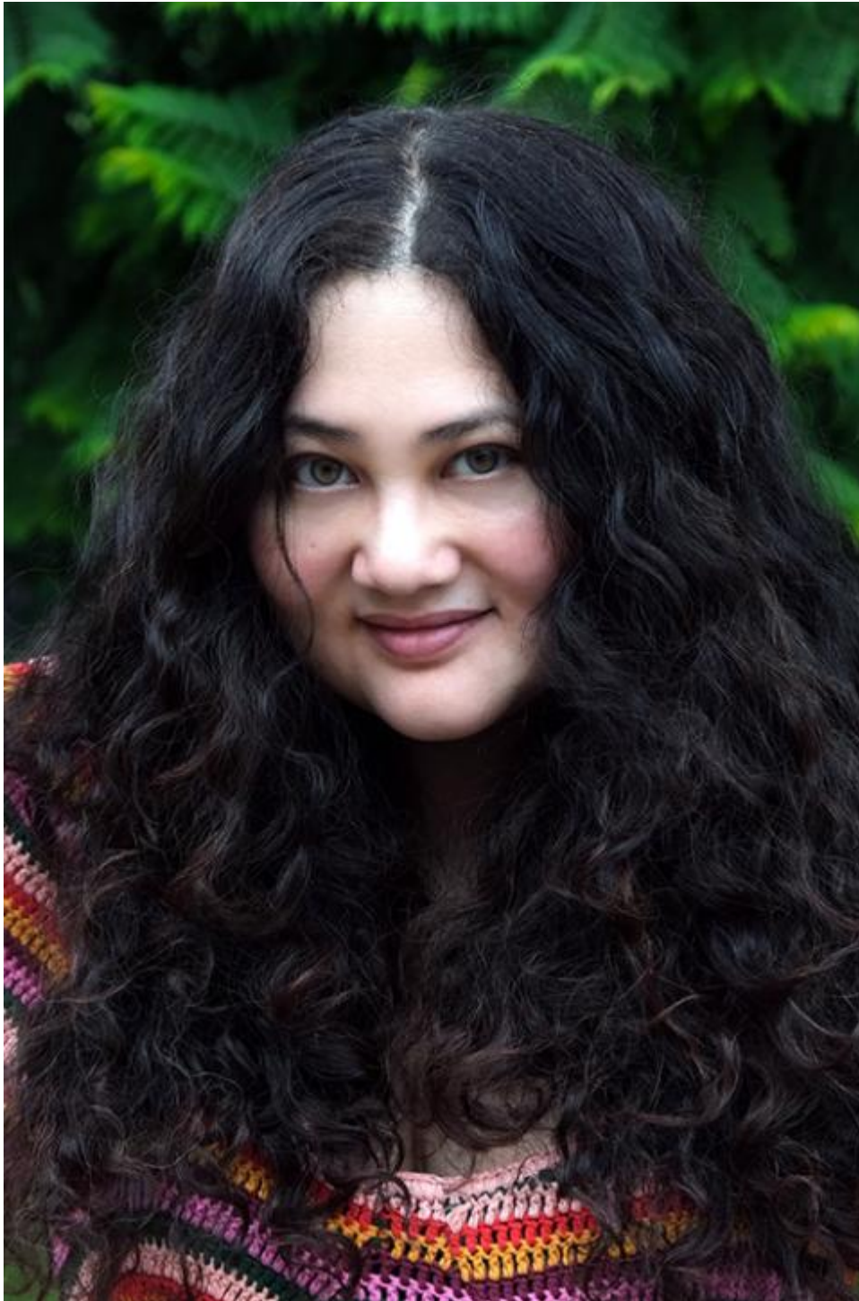
Gabrielle Zevin, author of Tomorrow, and Tomorrow, and Tomorrow

Beyond their initial meeting in the hospital room, Sadie and Sam's friendship sees rifts, fractures and bickering. At times, the two are driven apart — for months or years — by arguments that stem from one or the other's blindness to disparities of wealth, disability, race or gender. Other times, the two meet again in tender