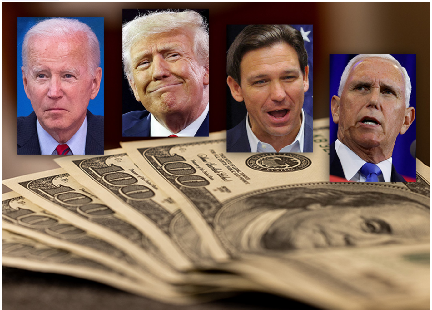
From left: President Joe Biden ; former President Donald Trump ; Florida Gov. Ron DeSantis ; former U.S. Vice President Mike Pence.