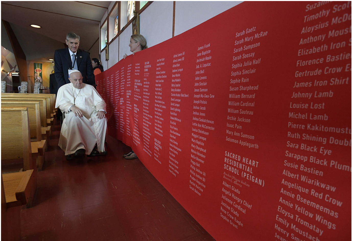
Pope Francis prays in front of a banner bearing the names of each of the 4,120 Indigenous children and the residential school where they died, in this photo from his visit to Maskwacis, Alberta, July 25, 2022.