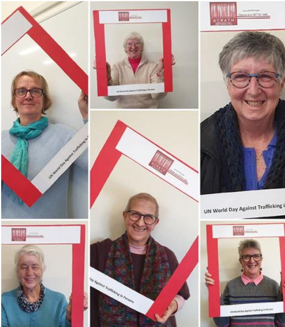
Victorian members of Australian Catholic Religious Against Trafficking in Humans, showing their support for the U.N. World Day Against Trafficking in Persons in 2021

In Australia, Good Shepherd Sisters don't work directly with people who are trafficked; we are members of Australian Catholic Religious Against Trafficking in Humans, or ACRATH , which assists in education, advocacy and support and works with other NGOs and state and federal governments to address the issue. Recently, advocacy over 17 years bore fruit for a group of workers from Vanuatu who received wages that had been kept from them. In May 2023, the Australian government allocated funds so victims and survivors of human trafficking can access support without involving law enforcement. A momentous achievement! This gives families safety and protects their immigration status. Their stories have informed advocacy