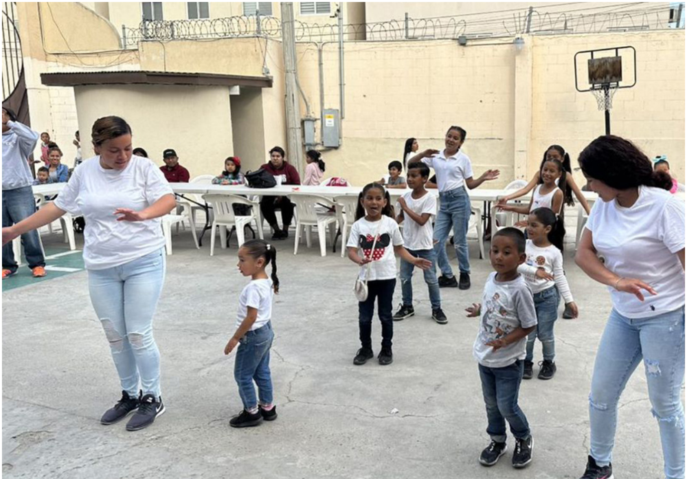
Kids dance during a fun activity at Casa Eudes in Tijuana, Mexico.

In 2021, Good Shepherd responded to cross-border migration in Tijuana, Mexico, setting up Casa Eudes , a community center that supports women and children and helps families rebuild their lives.