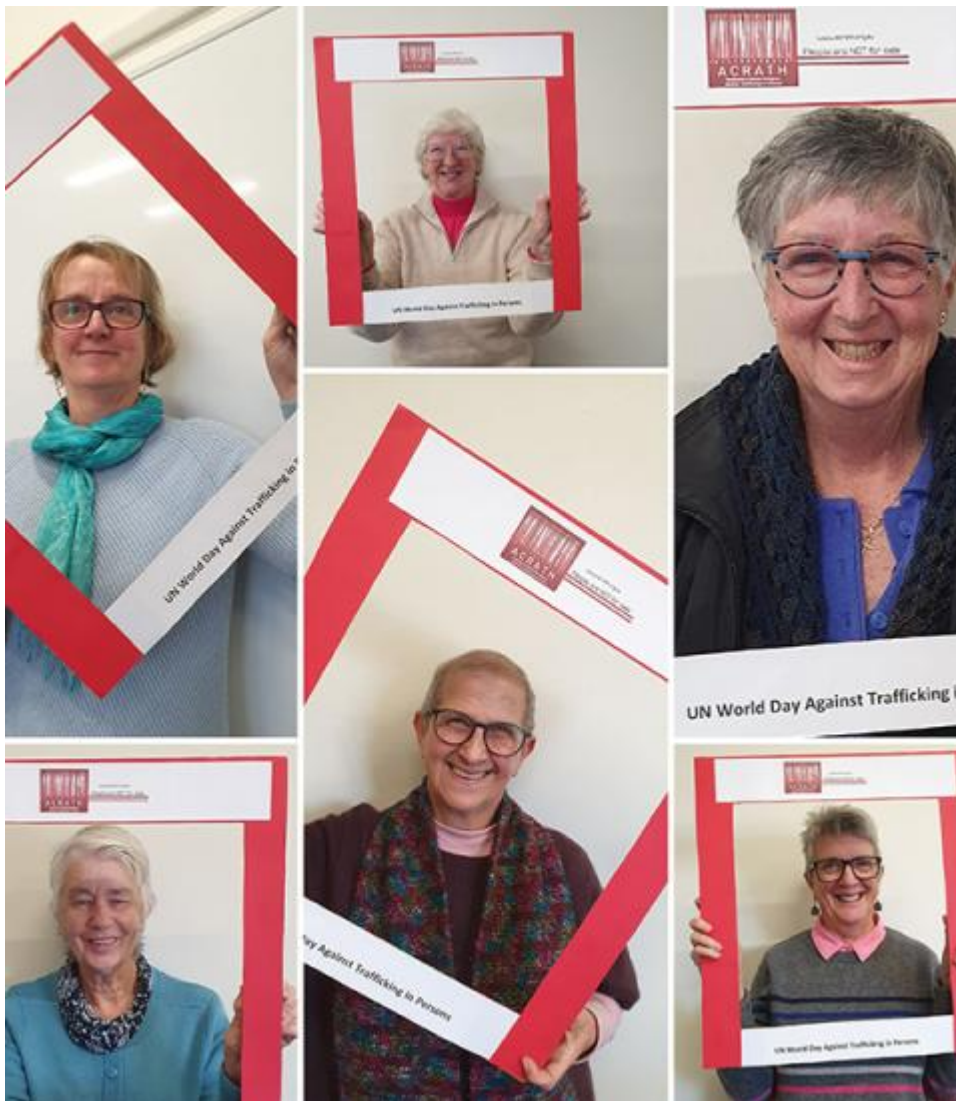
Victorian members of Australian Catholic Religious Against Trafficking in Humans, showing their support for the U.N. World Day Against Trafficking in Persons in 2021

In Australia, Good Shepherd Sisters don't work directly with people who are trafficked; we are members of Australian Catholic Religious Against Trafficking in Humans, or ACRATH , which assists in education, advocacy and support and works with other NGOs and state and federal governments to address the issue. Recently, advocacy over 17 years bore fruit for a group of workers from Vanuatu who received wages that had been kept from them. In May 2023, the Australian government allocated funds so victims and survivors of human trafficking can access support without involving law enforcement. A momentous achievement! This gives families safety and protects their immigration status. Their stories have informed advocacy