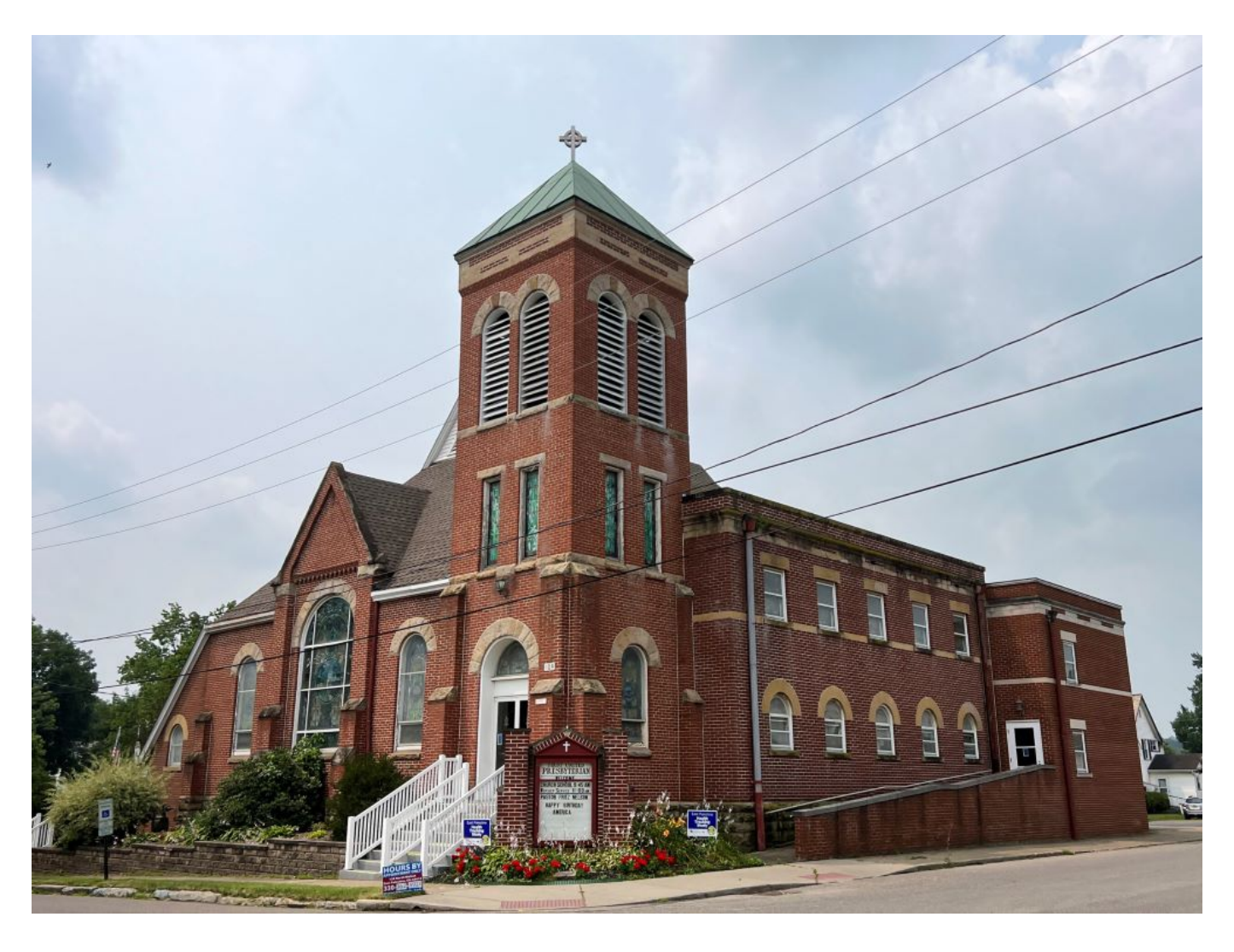
First United Presbyterian Church in East Palestine, Ohio, on July 17, 2023.