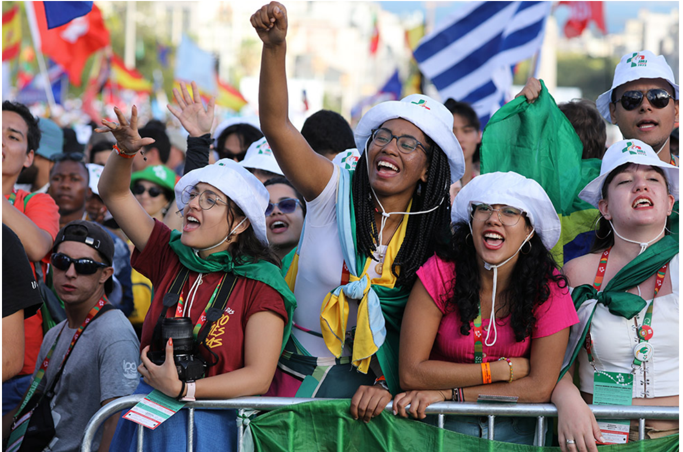
Pilgrims cheer prior to the opening Mass for World Youth Day at Eduardo VII Park in Lisbon, Portugal, Aug. 1, 2023.