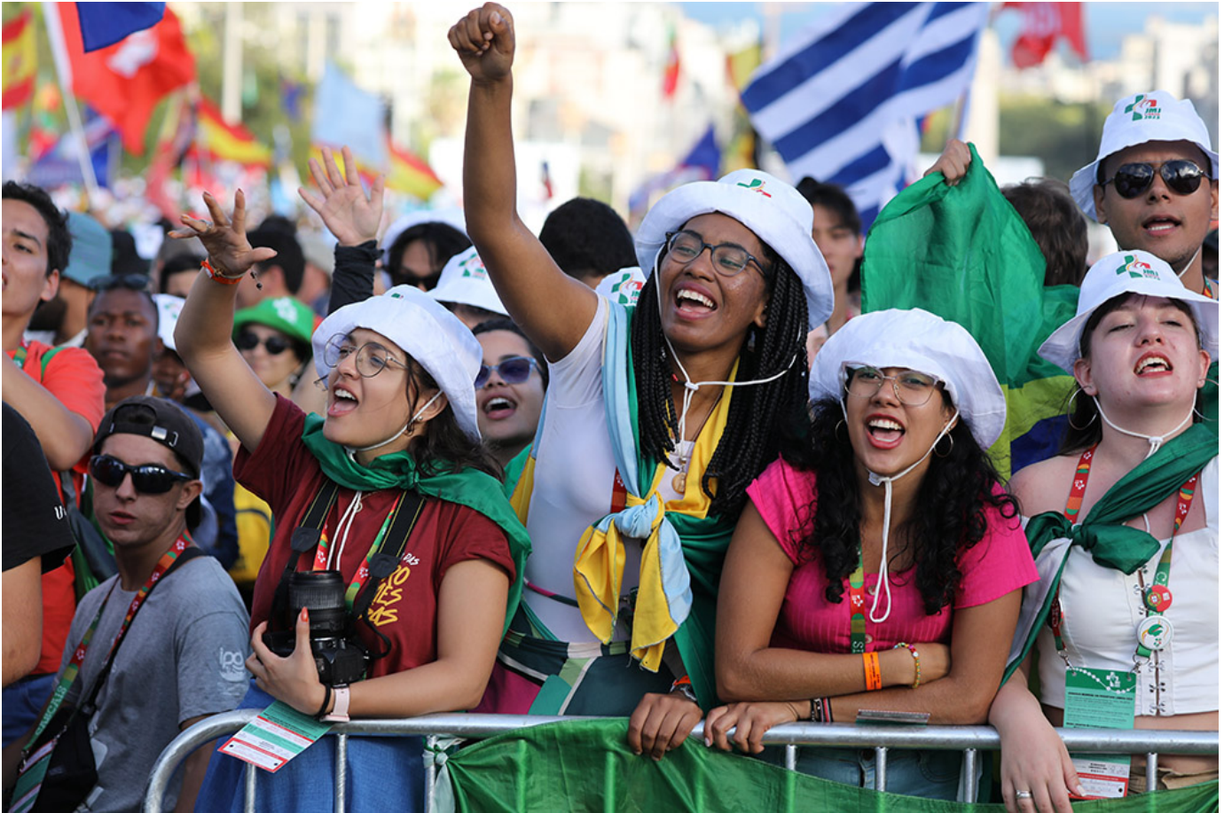
Pilgrims cheer prior to the opening Mass for World Youth Day at Eduardo VII Park in Lisbon, Portugal, Aug. 1, 2023.