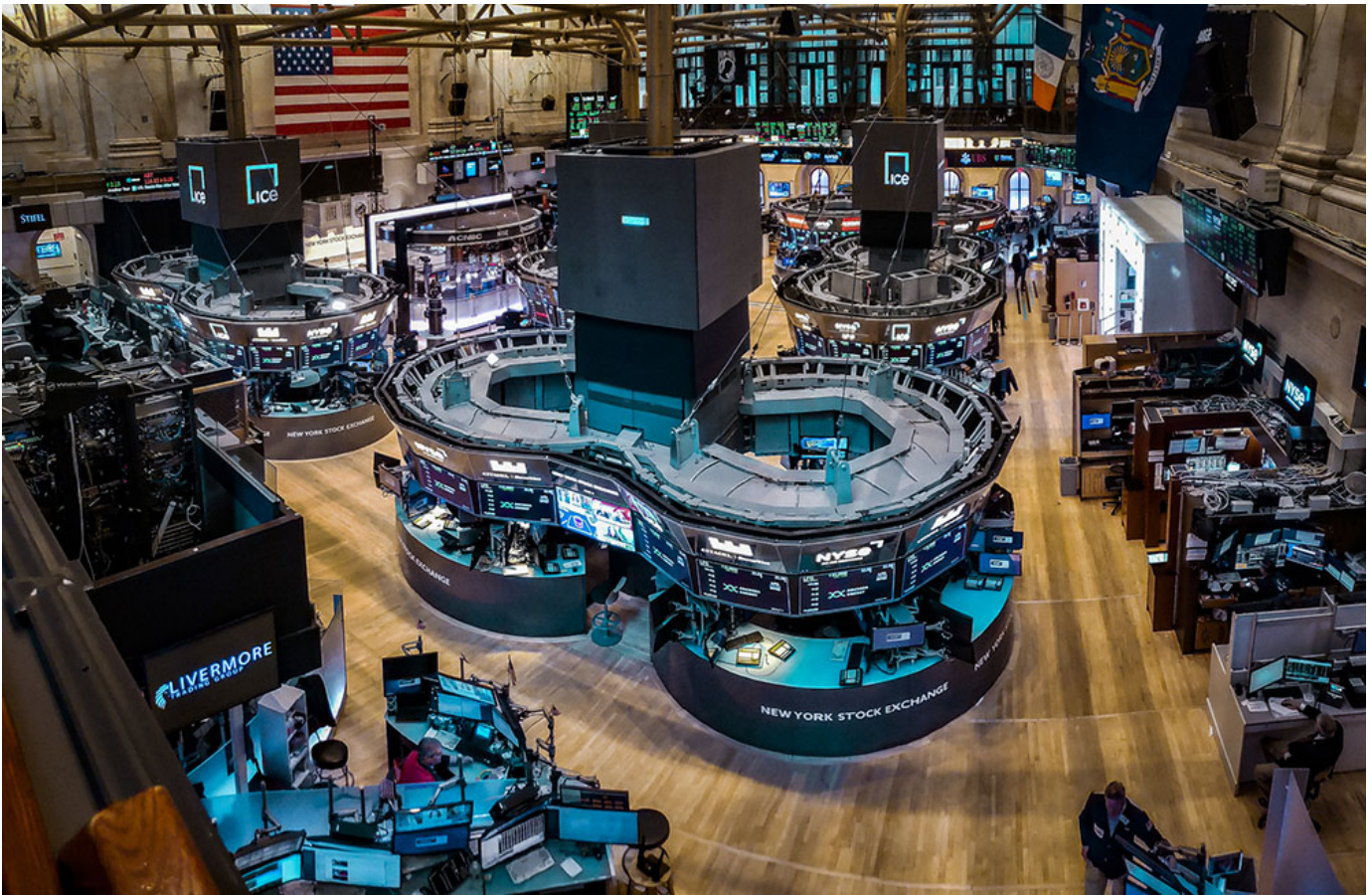
A view of the trading floor at the New York Stock Exchange in 2022

"I don't think it's determinative in terms of the changes of votes," Smith said of the anti-ESG efforts. "It's one factor of half a dozen."