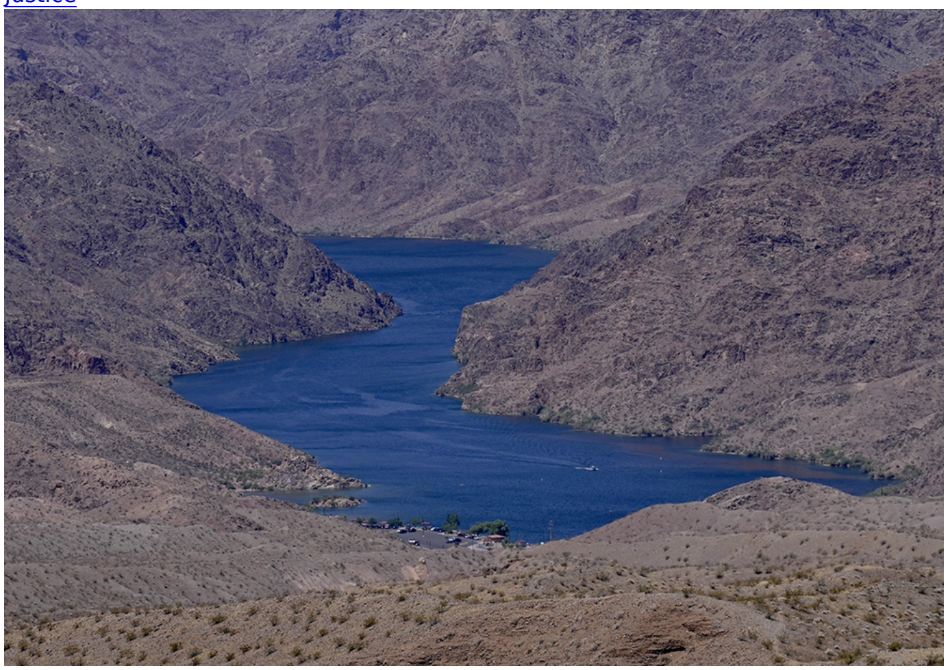
The Colorado River cuts through Black Canyon June 6, 2023, near White Hills, Arizona.