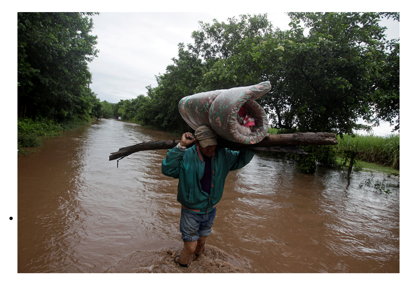
A man carries his belongings through a flooded road in Marcovia, Honduras, Nov. 18, 2020, after the passing of Hurricane lota.

"It was producing very good before that," he told EarthBeat, pointing to his land. "That hurricane was too much. We weren't able to work again because the soil was wet all over."