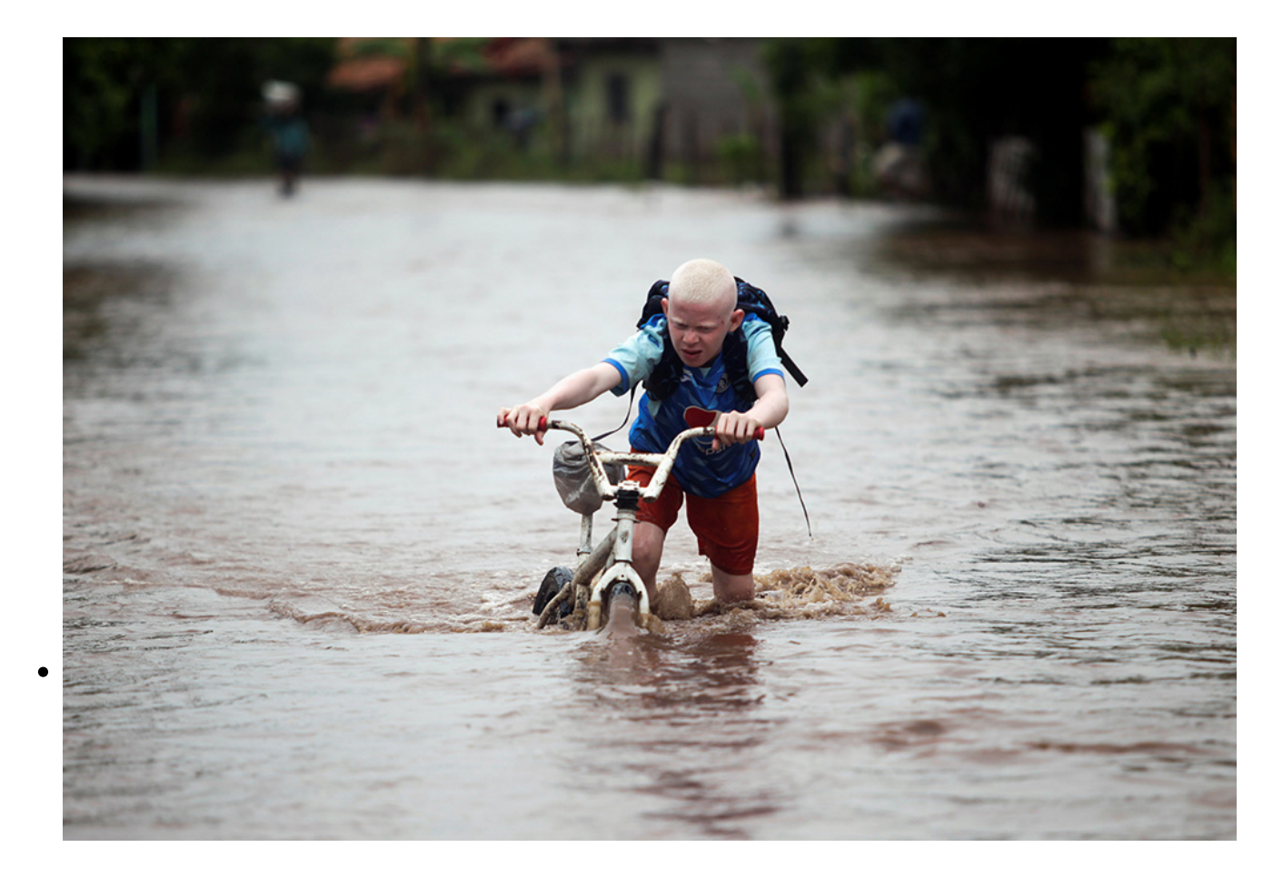
A child pushes his bicycle through a flooded road in Marcovia, Honduras, Nov. 18, 2020, after the passing of Hurricane Iota.