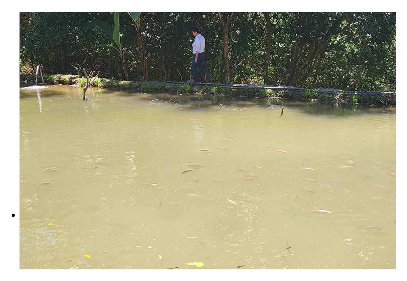
A pond on the property of Rony Figueroa holds 3,000 tilapia, which provide an additional source of income for the family farmer in central Honduras.

"You need clothes, you need food and all of that. There's no employment sources, so people migrate," Figueroa said.