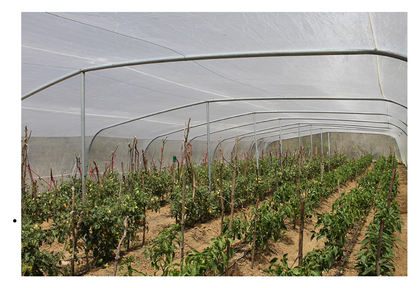
A greenhouse on Rony Figueroa's farm holds rows of tomatoes and green bell peppers.