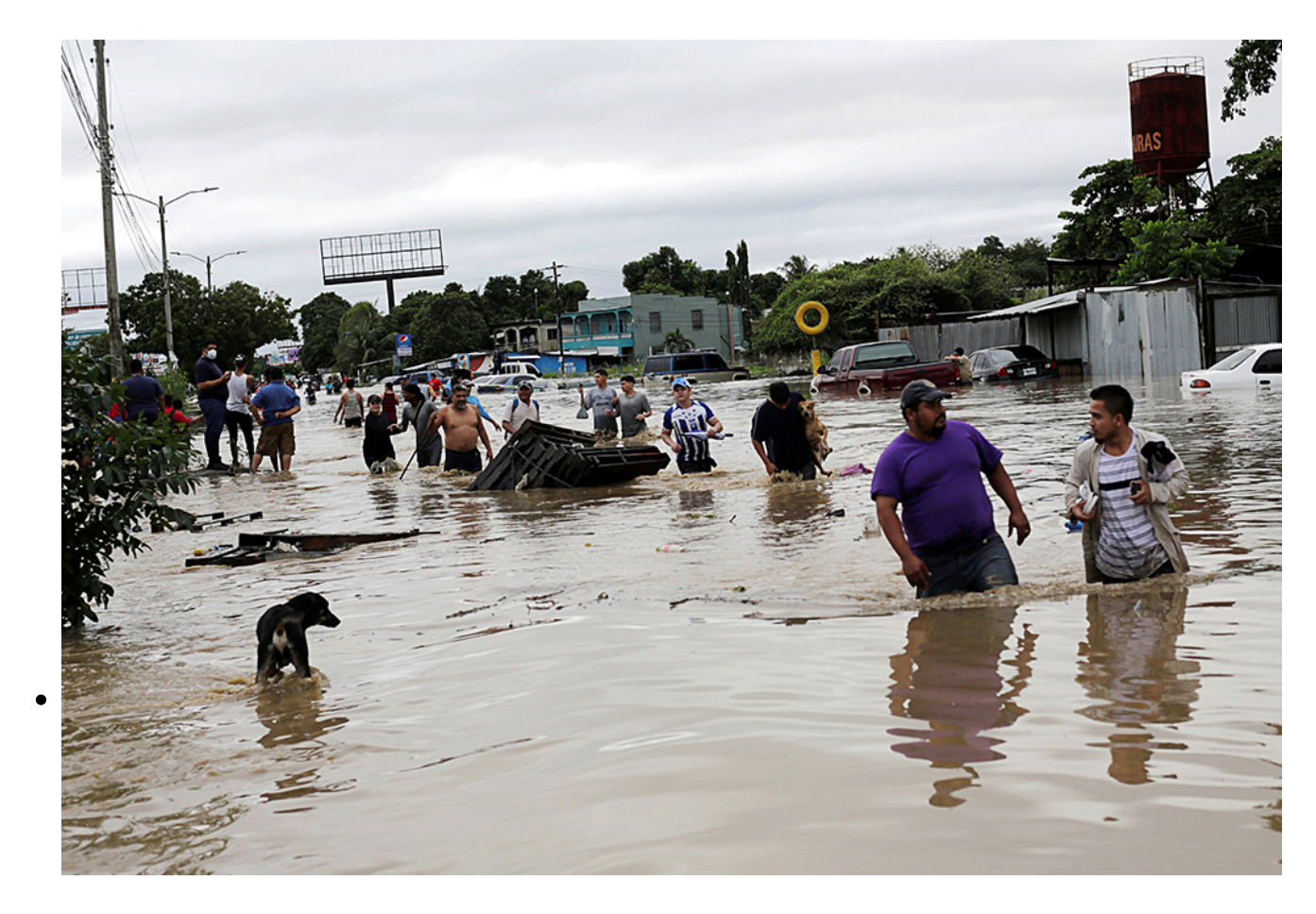
People wade through floodwaters in La Lima, Honduras, Nov. 5, 2020, in the rain-heavy remains of Hurricane Eta.