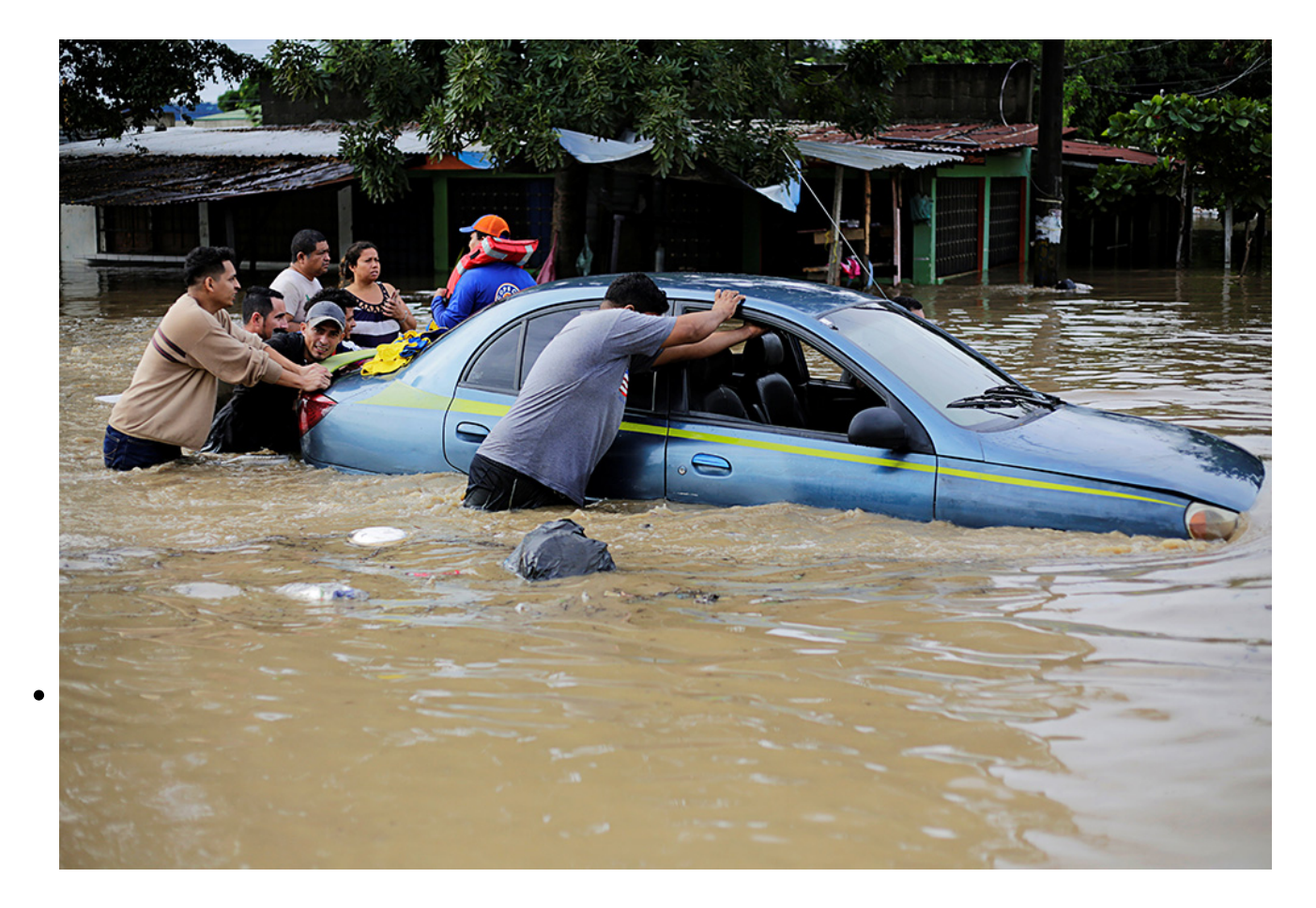
Men push a car through floodwaters in La Lima, Honduras, Nov. 5, 2020, in the rain-heavy remains of Hurricane Eta.