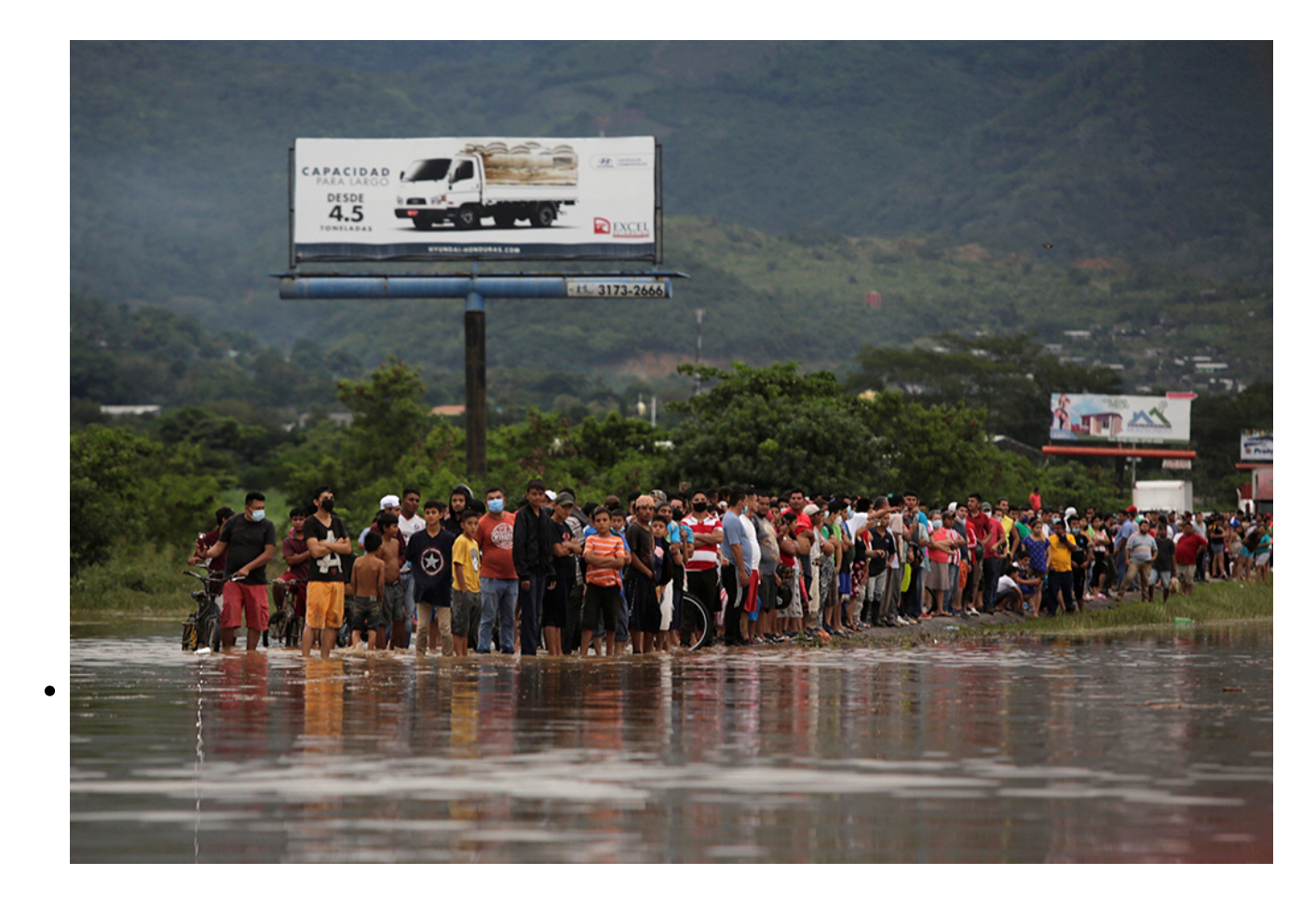
People stand alongside floodwaters in La Lima, Honduras, Nov. 5, 2020, in the remains of Hurricane Eta.