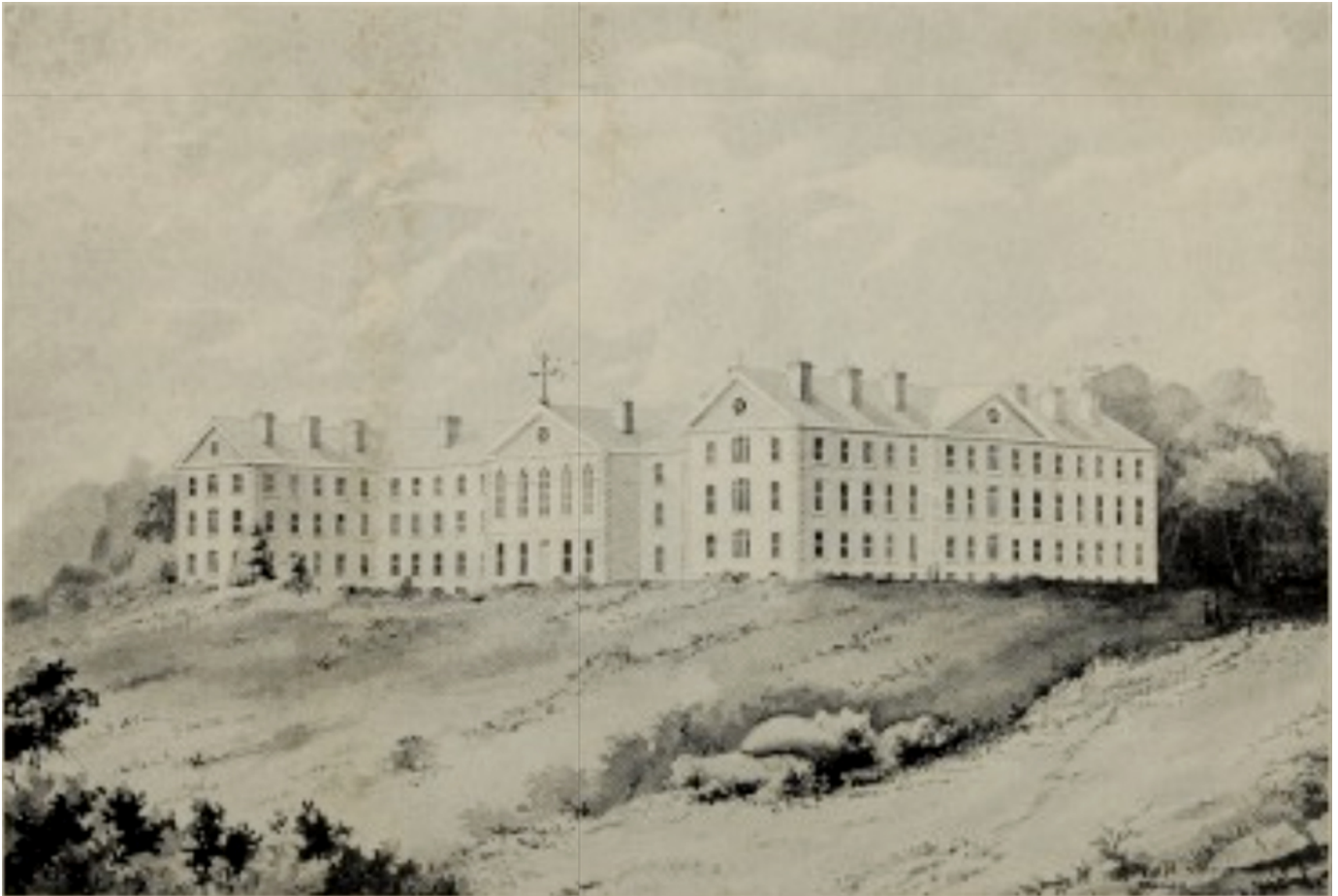
Drawing of Woodstock College in Woodstock, Maryland, in 1871