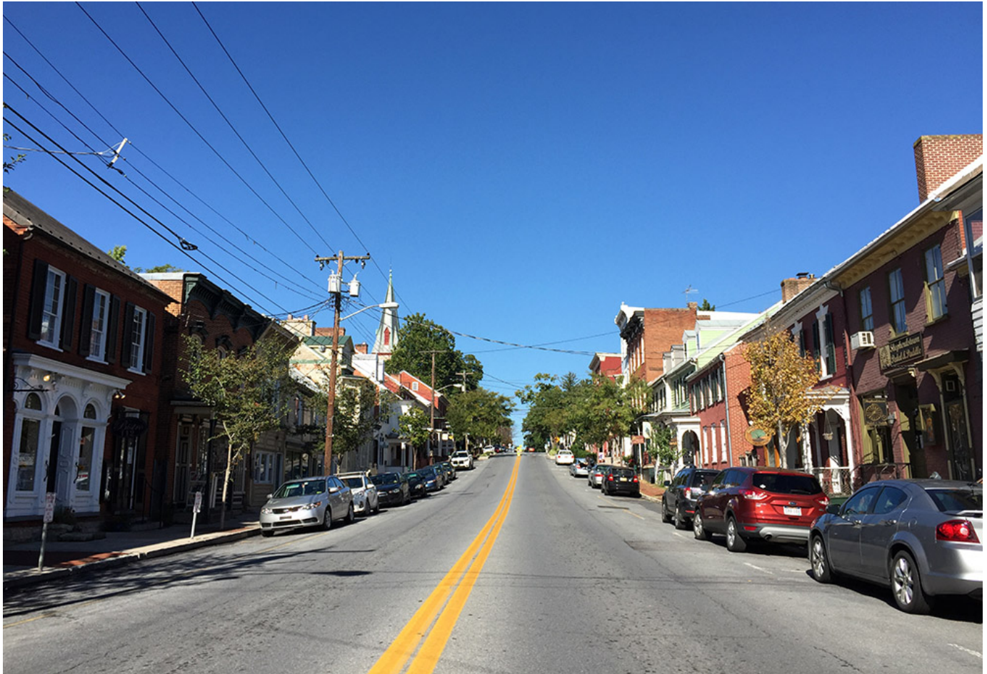
View of a street in Shepherdstown, West Virginia