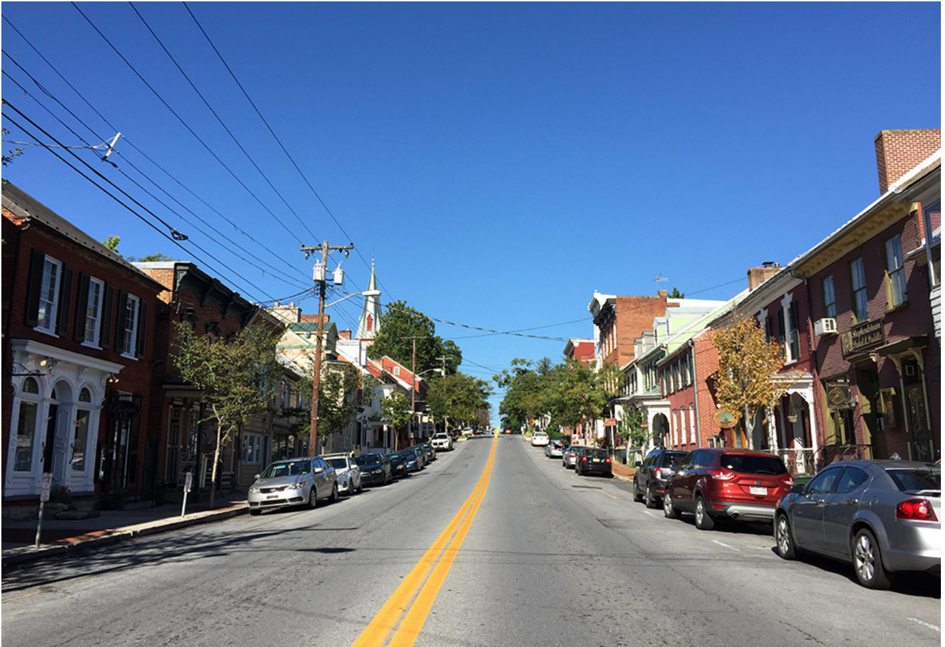
View of a street in Shepherdstown, West Virginia