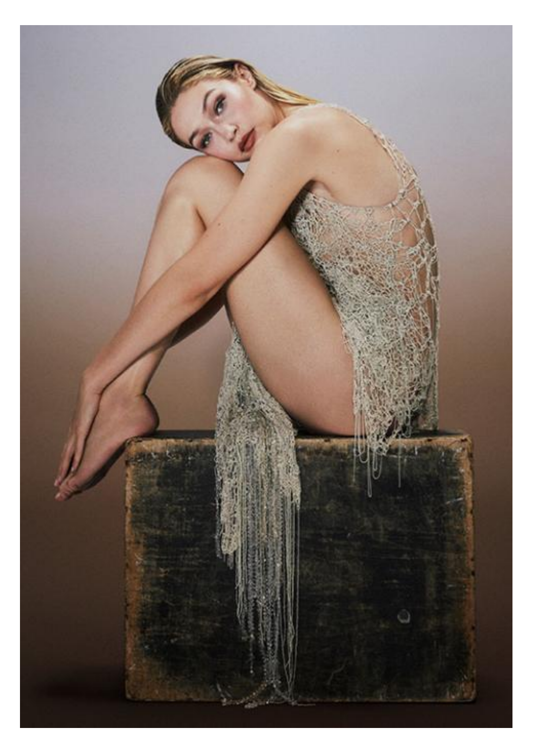
Gigi Hadid in custom look designed by VS20 Bogotá designer Melissa Valdés

But this serious tone is not even echoed in the framing. Model Gigi Hadid's rom-comstyle voice overs used to transition between mini-shows are frustrating and distasteful in contrast to the newfound sincerity of the artistry. Viewers can't help but be confused: Are we supposed to take this seriously?