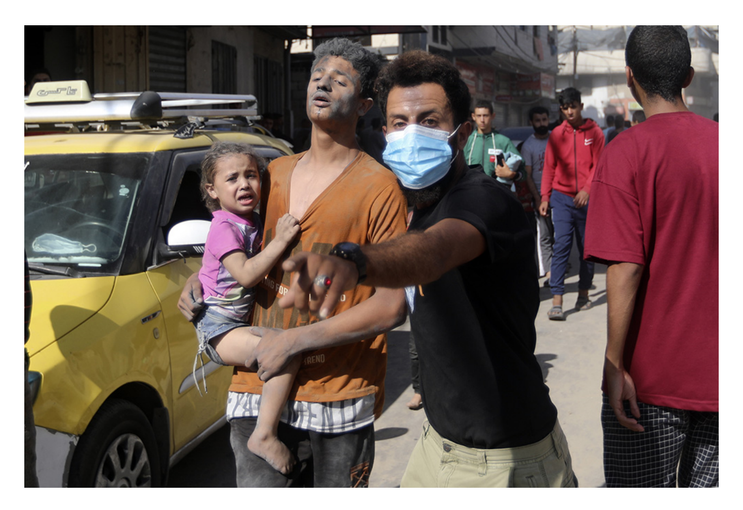
Injured Palestinians are evacuated following Israeli airstrikes on the town of Khan Younis, southern Gaza Strip, Oct. 26.

There will be a military conclusion. No matter who wins and who is humiliated, whether Hamas is eliminated, the long-term enmity and its causes will not be resolved.