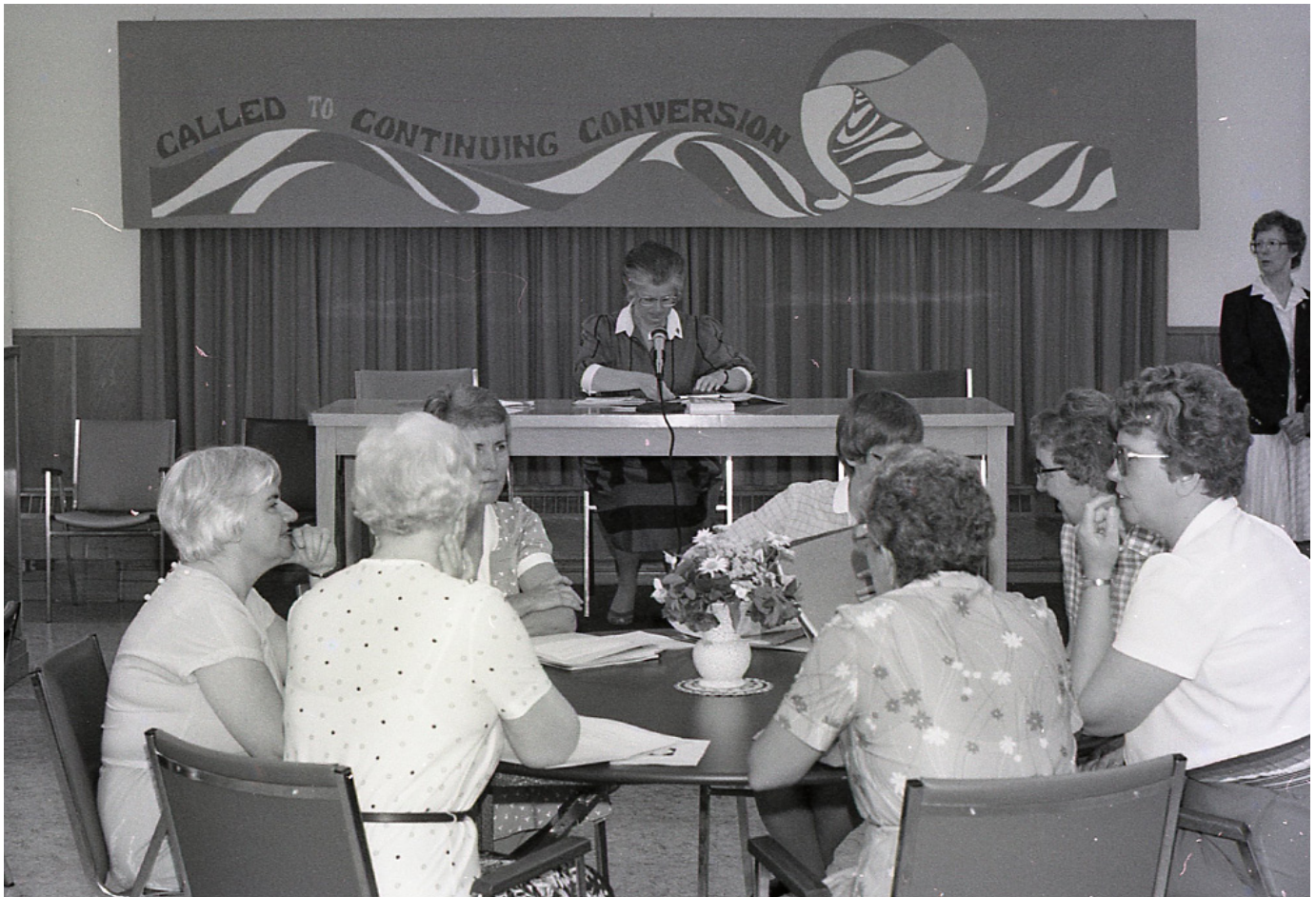
Sisters of Charity of Halifax are pictured at a table during their 15th General Chapter in 1984.

Despite unrealistic expectations, open defiance, and disregard of the process by some, the 41-page final report describes an experience of harmony at the Vatican assembly in October. The chapters of renewal identify convergences, issues in need of study and practical proposals regarding synodality, discipleship, and mission, along with challenges ahead.