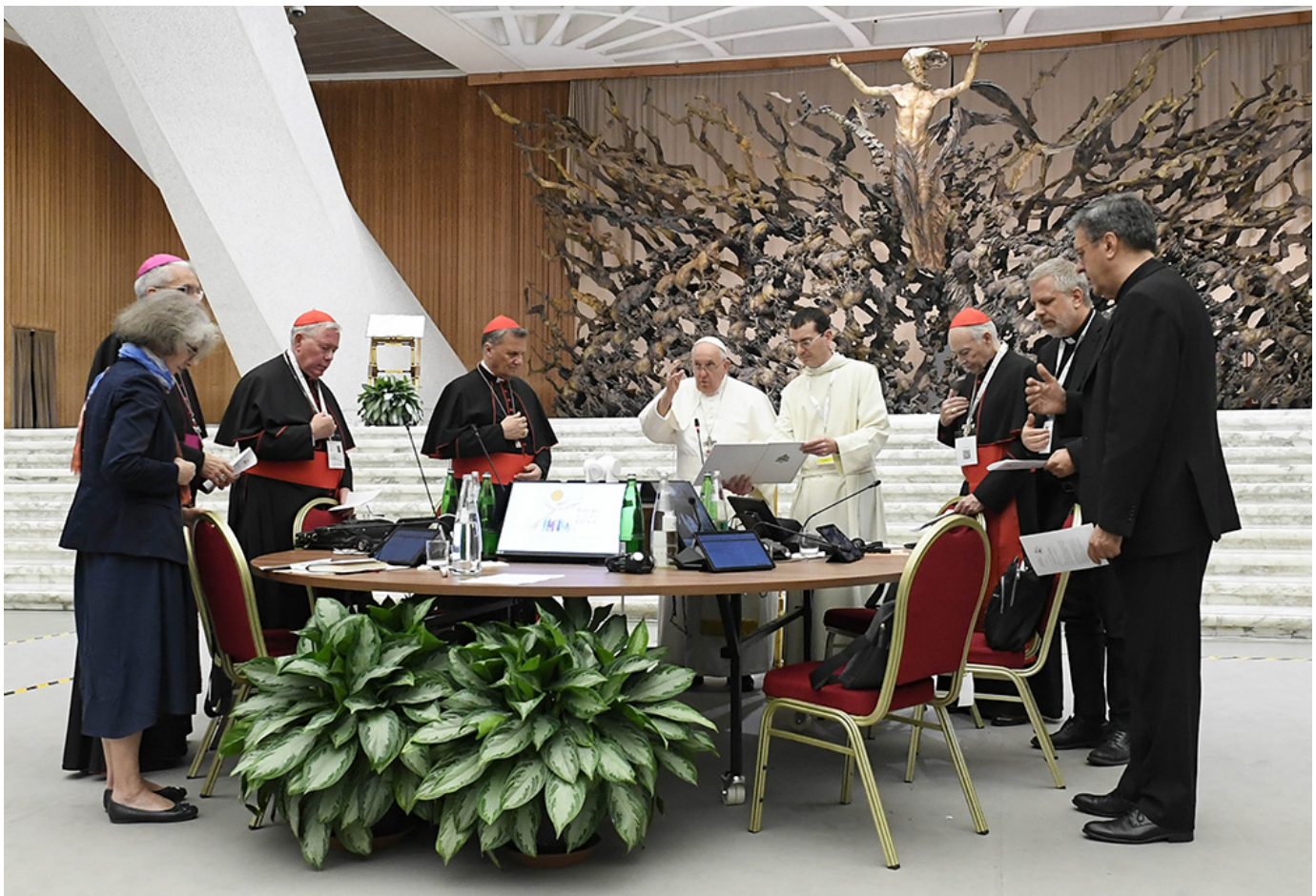
Pope Francis gives his blessing at the conclusion of the assembly of the Synod of Bishops' last working session Oct. 28, 2023, in the Paul VI Hall at the Vatican.

The Holy Spirit could not have stirred the heart of Pope Francis at a more urgent time, considering the division, intolerance, indifference, exclusion, and inequality in our world. Since the onset of the synod, there has been a profound conversion experience across various groups in my community, deeply impacting our core values and ideals in religious life, a witness of the Catholic Church in glory. The synod has called for an overhauling of the systems of operation within the church and her structures, while preserving the rich traditions and cultures that have stood the test of time. There is a great sense of hope that the conclusion of the general gathering of the synod delegates will yield abundant fruits.