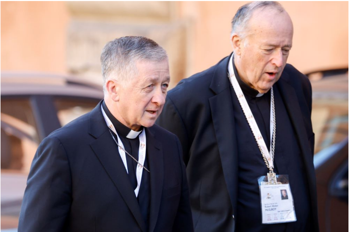
Cardinals Blase Cupich of Chicago (left) and Robert McElroy of San Diego arrive for a session of the assembly of the Synod of Bishops in the Vatican's Paul VI Audience Hall Oct. 17.

2. Synodality demands a willingness to change. We all tend to become set in our ways in a manner that limits our ability to authentically grow as disciples of Jesus Christ. Synodality calls us to overcome our complacency and remain actively engaged in the process of growth and sanctification that lies at the heart of discipleship.