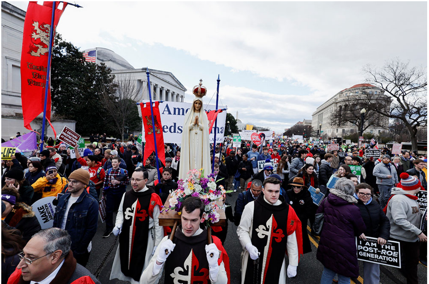
Pro-life demonstrators carry a statue of Mary during the annual March for Life in Washington Jan. 20, 2023. It was the first time the march was held since the high court overturned its 1973 Roe v. Wade abortion decision June 24, 2022.

Legislation that makes abortion inaccessible increases the likelihood of women turning to dangerous illegal abortions. It can also lead to women being jailed for miscarriages, or dying due to lack of access to life-saving health care. Pro-life leaders have demonstrated that they are not to be trusted with matters as delicate, complex and personal as women's reproductive health.