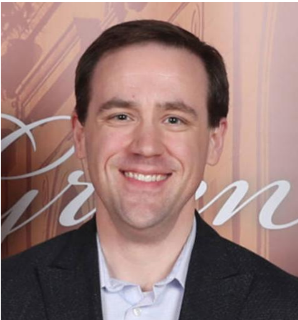
Kevin Vallier

Integralism did not just happen. It grows out of a crisis in liberalism. "The integralists have given a voice to young Christians, many of whom have grown up alienated from their institutions," Vallier, who teaches at Bowling Green State University , writes. "These young people, often on the political Right, are not traditional small-government conservatives. They are not especially enamored of the Constitution, and they do not care about reading it according to original public meaning."