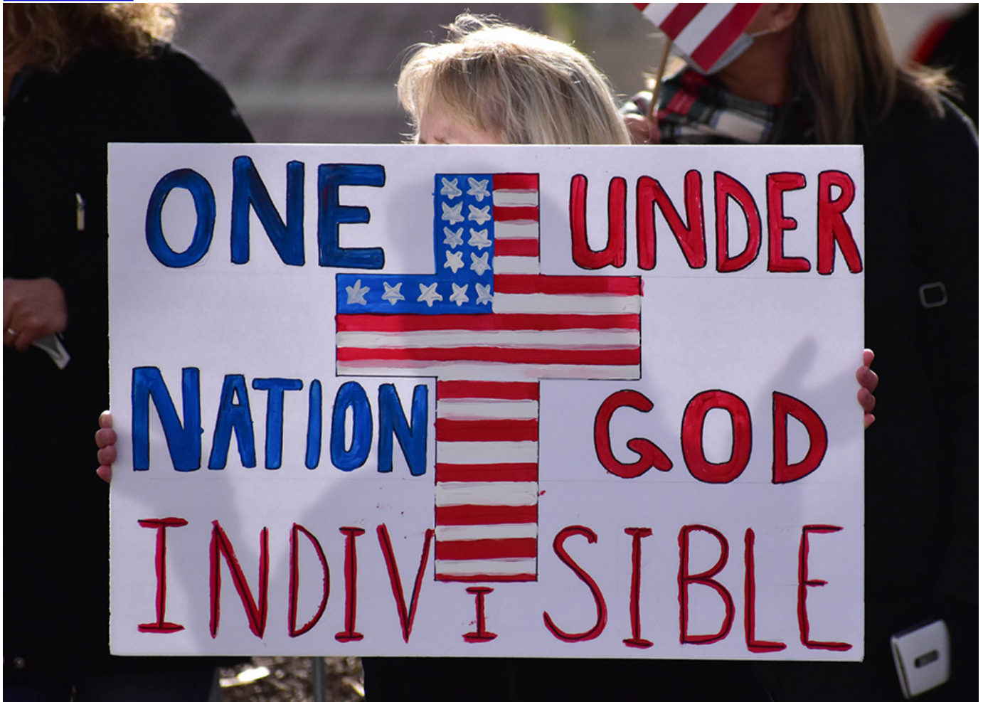
A "Stop the Steal" rally is held in Raleigh, North Carolina, on Jan. 6, 2021.