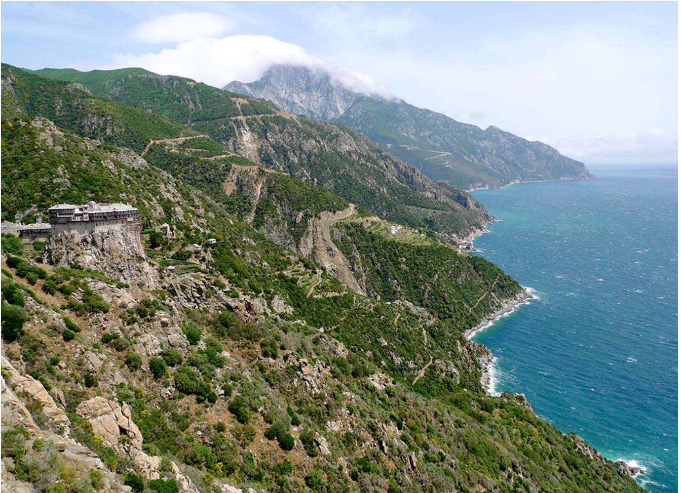
The Monastery of Simonos Petra is seen on Mount Athos in Greece.

The problem throughout this book, and I suspect most books about integralism suffer from the same problem, is that it is a sane analysis of madness. You make the same kind of marginal notes you do in other books — "strong argument," "good point," and "is this true?" — but then you put it down and wonder if you are still on planet Earth.