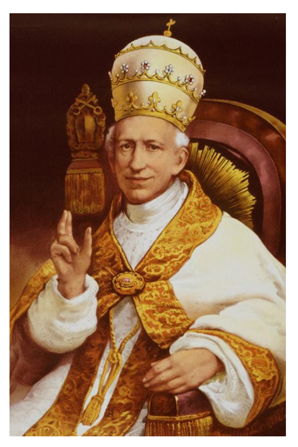
Pope Leo XIII in an official Vatican portrait circa 1878

In looking back on papal history, Pattenden said he believes the most obvious comparison to Francis is likely the late-19th-century <a href="Pope Leo XIII">Pope Leo XIII</a>, who reigned from 1878 to 1903.