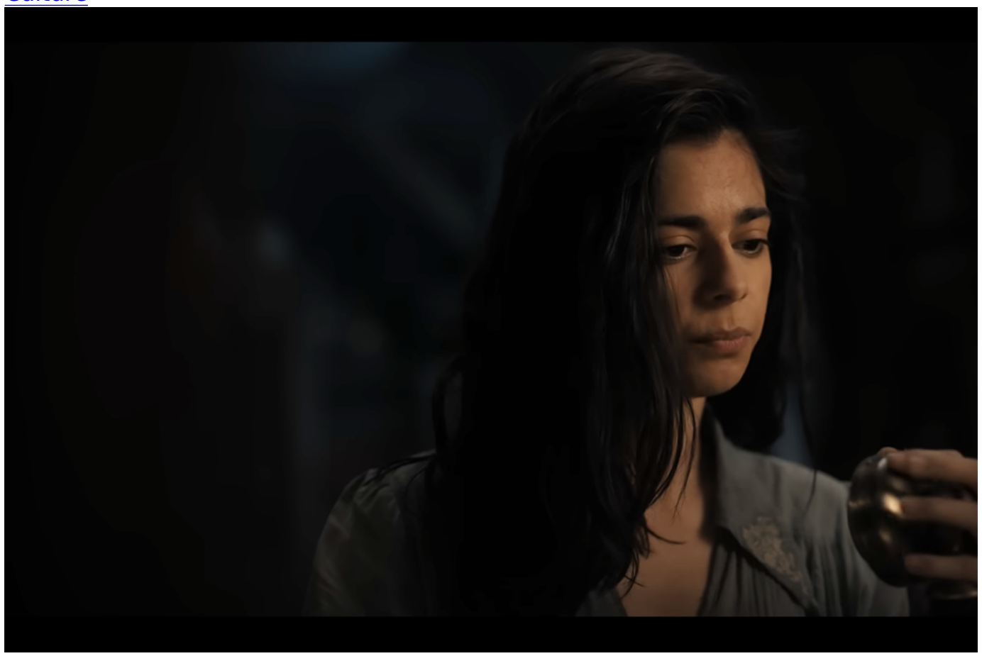
Aria Mia Loberti stars in "All the Light We Cannot See" on Netflix