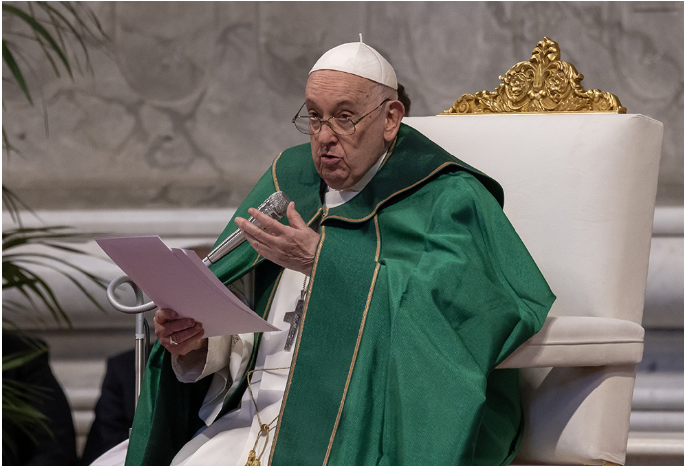
Pope Francis gives his homily during Mass for the World Day of the Poor in St. Peter's Basilica Nov. 19, 2023, at the Vatican.

According to the The Washington Post of June, 29th, 2023, over 238,000 people died in global conflict in 2022. This was among the highest in recent years. Conflicts and wars have continued to be recorded, with the latest being in the Holy Land. By the end of November 2023, over 14,000 people had been killed. With such a bleak reality, is it possible to conceive a world where peace reigns? The answer is yes. Scripture reminds us that the birth of Christ, the Prince of Peace, brings hope for a better world. Like the angels announcing his birth, we too can sing "Glory to God in the highest and on earth peace to those on whom his favor rests" ( Luke 2:14 ).