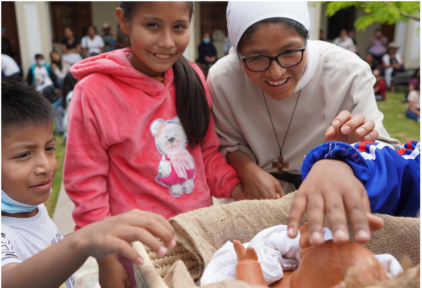
Children come to adore the baby Jesus at the Christmas gathering at the Monastery of the Incarnation in Lima, Peru.