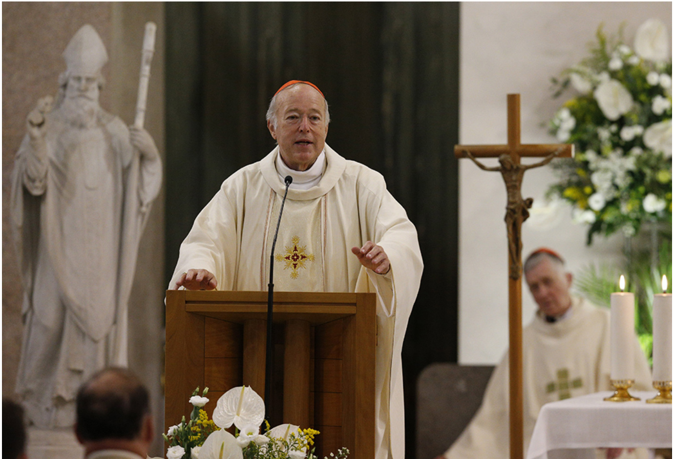
Cardinal Robert McElroy of San Diego gives the homily as he celebrates a Mass of thanksgiving at St. Patrick's Church in Rome in this Aug. 28, 2022, file photo.