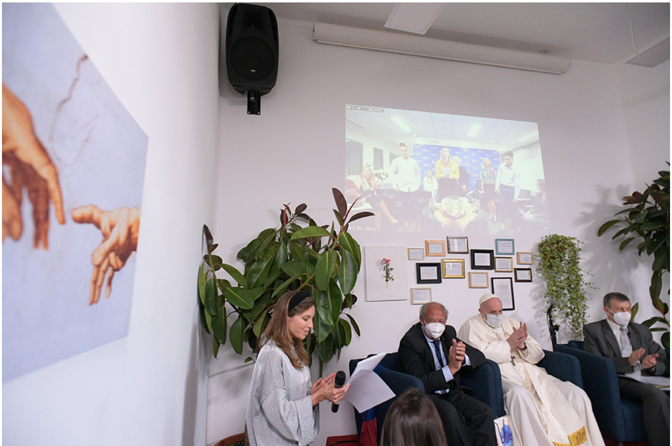
Pope Francis leads a meeting at the Scholas Occurrentes headquarters in Rome May 20, 2021. The pope was joined by video with Cardinal Wilton Gregory of Washington and students at Archbishop Carroll High School in the Archdiocese of Washington to announce the launch of a new Scholas Occurrentes chapter in the District of Columbia.

All this makes the distinction between Catholic higher education and non-Catholic colleges and universities relevant in a different way, or less relevant.