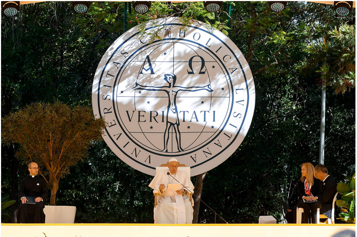
Pope Francis speaks to university students at the Catholic University of Portugal in Lisbon Aug. 3, 2023.