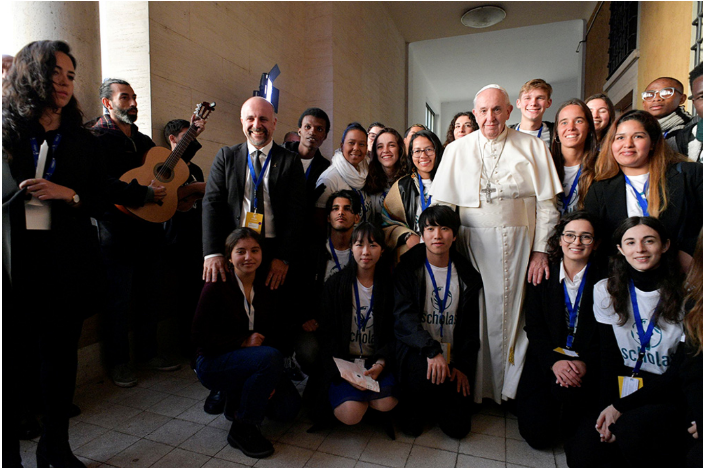
Pope Francis poses after he inaugurated the new headquarters of Scholas Occurrentes, the Vatican's foundation that works to link technology and the arts for social integration and world peace, in Rome Dec. 13, 2019.