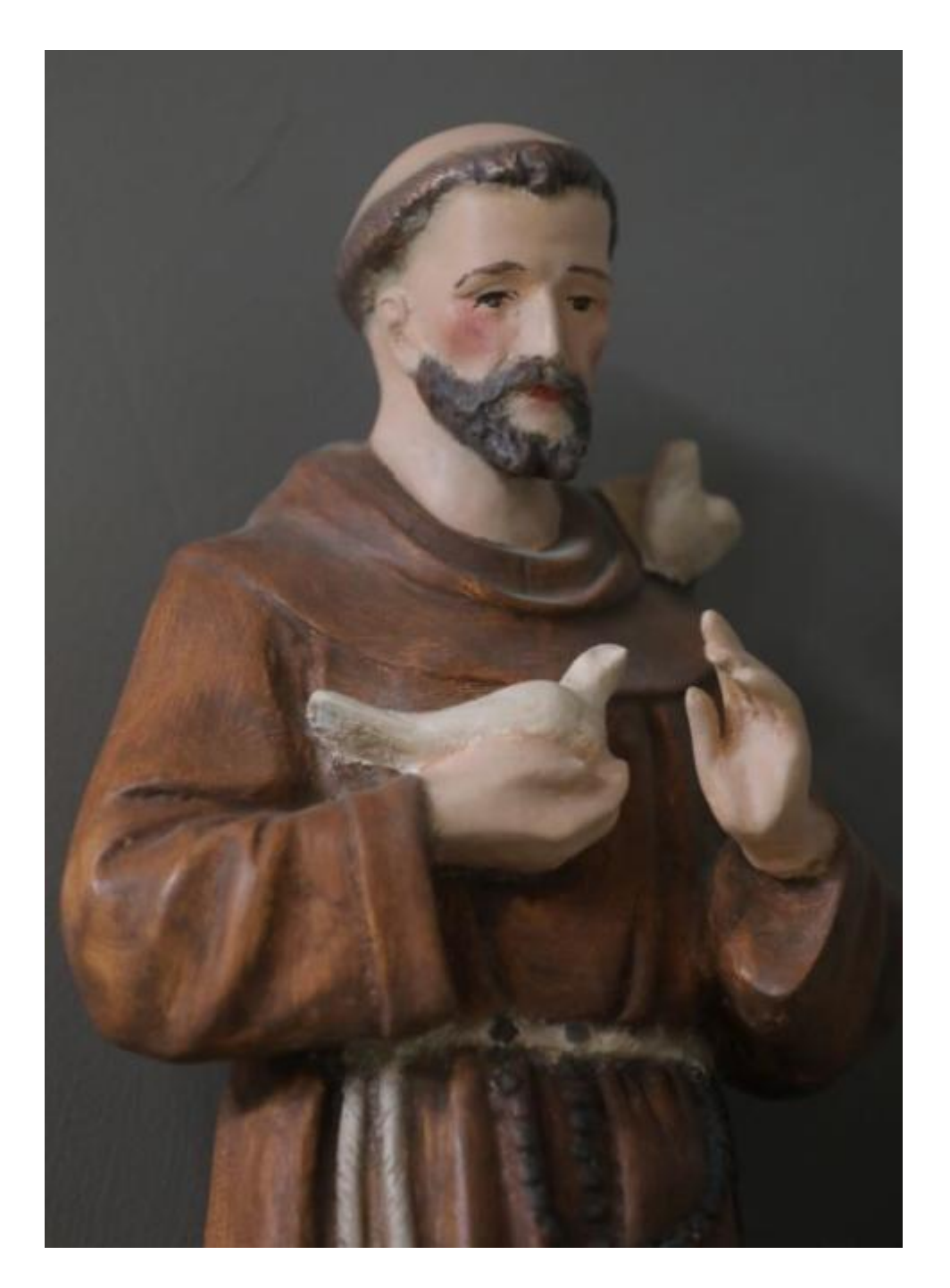
A statue of St. Francis of Assisi is displayed inside Jesus the Divine Word Church in Huntingtown, Maryland, Aug. 20, 2021.

I would suggest to you that the spirituality of Laudato Si' provides an important and particularly potent pathway for bringing students into encounter with God. It invites men and women to see the transcendent present in creation. It calls us to understand that the creation is a gift from a loving God who cherishes us, and that our response should be gratitude rather than domination. It calls us to understand