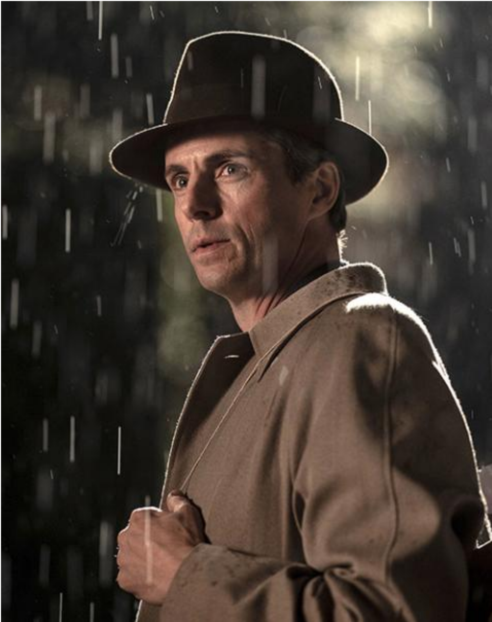
Matthew Goode as C.S. Lewis in "Freud's Last Session"

And so, as Lewis lingers in Freud's home, witnessing the doctor's slow decline from oral cancer, he can't help but care for him. He walks his dog and retrieves fresh handkerchiefs. He accompanies the doctor — and Freud allows it. Despite the clear defenses around so much of his life, in this simple, quiet moment when the world was at war, Freud allows Lewis in.