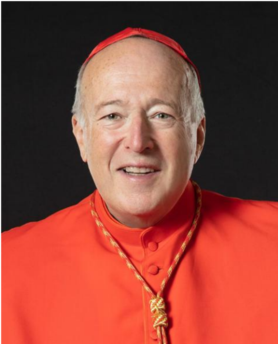
Cardinal Robert McElroy

How can a government, or a civilization for that matter, prosper if it believes all knowledge is relative? If it is not willing to wrestle with the reality of things? Certainly, our climate has no hope if we dismiss the objective reality staring us in the face.