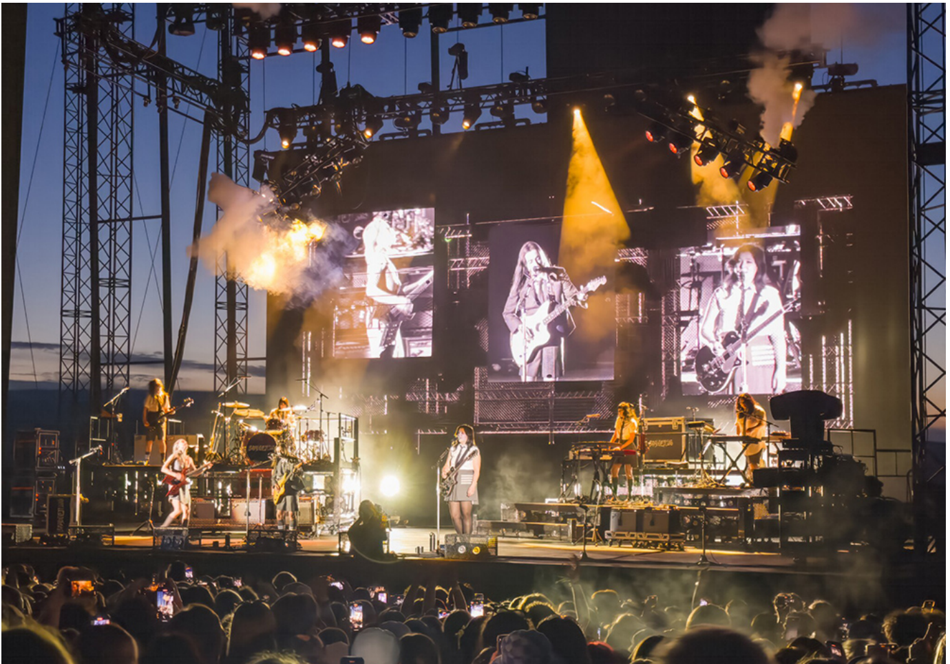
Boygenius performs live in July 2023, the hottest month ever recorded

Maybe it was the heat cooking my brain, or that despite a recent school shooting, Gov. Lee could only talk about how drag queens were the most dangerous thing facing Tennessee's children; or maybe it was that the Nashville Parthenon felt like a portrait of our country, an empire that daily feels more like a facade. A roadside attraction. Whatever was to blame, I found myself overcome with the sense that we are all languishing. We're living at the end of something, it seems; the end of an empire, capitalism or maybe the planet itself.