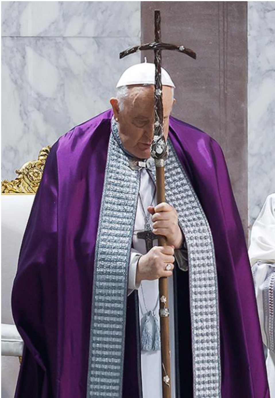
Pope Francis holds his crozier as the Gospel is read during his Ash Wednesday Mass at the Basilica of Santa Sabina in Rome Feb. 14.

The world tells us exactly the opposite: entertainment, pleasure, diversion and escape make for the good life. The worldly person ignores problems of sickness or sorrow in the family or all around him; he averts his gaze. The world has no desire to mourn; it would rather disregard painful situations,