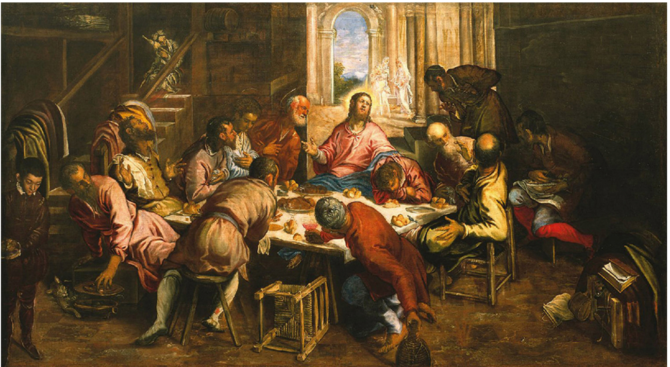
This photo represents Renaissance painter Tintoretto's "The Last Supper."

What about Holy Thursday? The institution of the Lord's Supper — what the Second Vatican Council called the "source and summit" of our faith — is fundamentally about a meal shared by Jesus Christ with those women and men closest to him. They took "fruit of the earth and work of human hands," as our eucharistic prayer reminds us, and consumed it as we do all food.