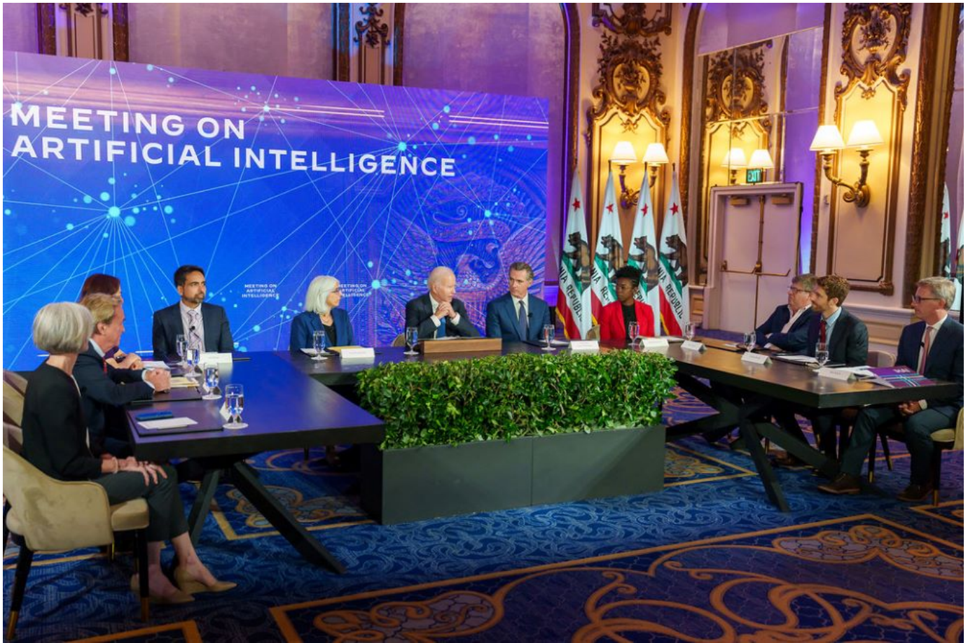
President Joe Biden hosts a meeting on artificial intelligence June 20, 2023, at The Fairmont hotel in San Francisco.

Hard questions need to be asked when developing them: "What will it accomplish?" and "What are the risks?" Technologists cannot answer these alone, for "the specialization ... makes it difficult to see the larger picture." They might insist that they seek to "save humanity" and to construct an AI that's "aligned" with humanity's goals. But just what are those goals, and what are we being saved from, or for?