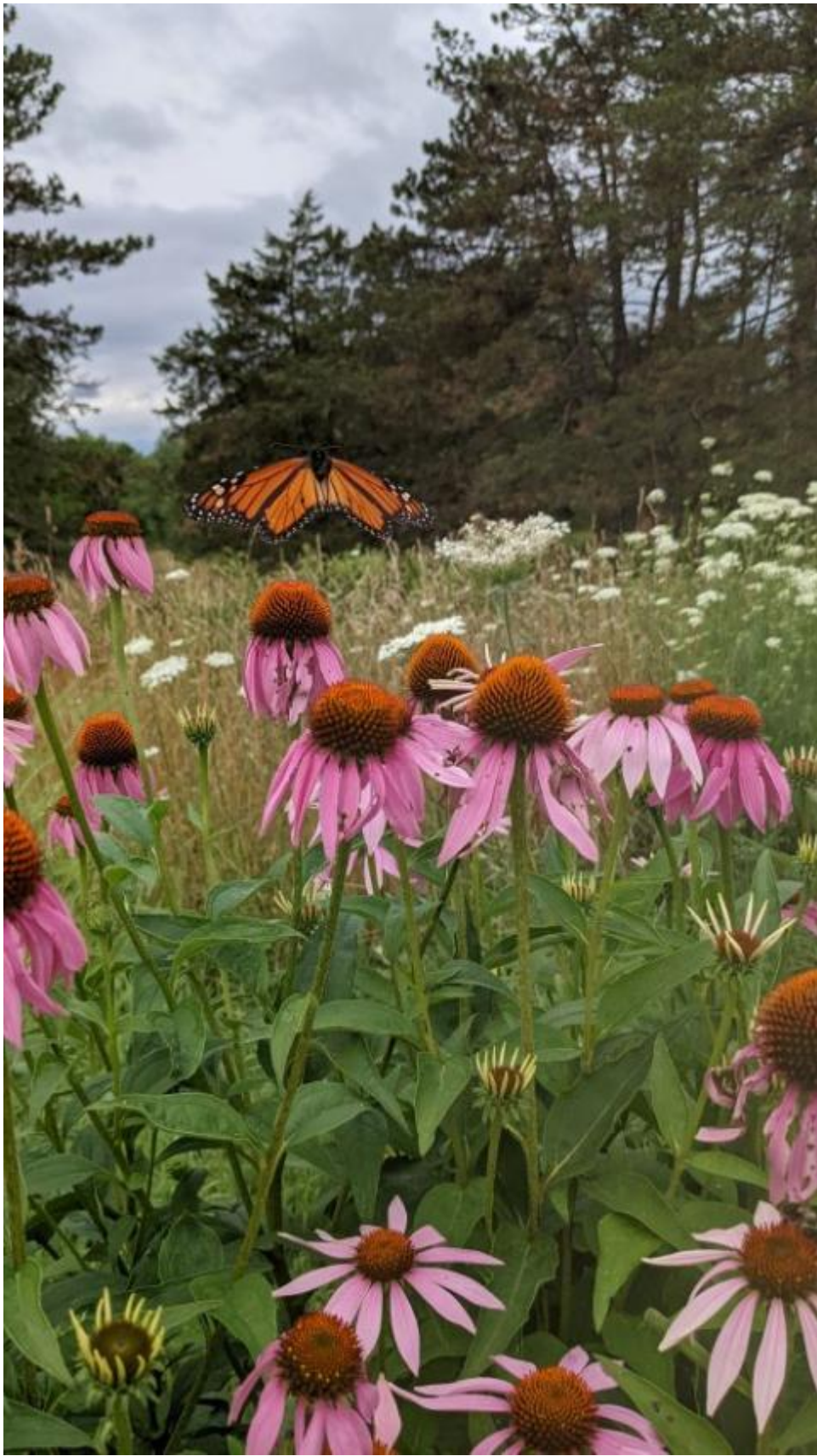
Flowers: In addition to land for farming, the Dominican sisters' property at Sinsinawa includes 10 acres of prairie and 10 acres of oak savanna.