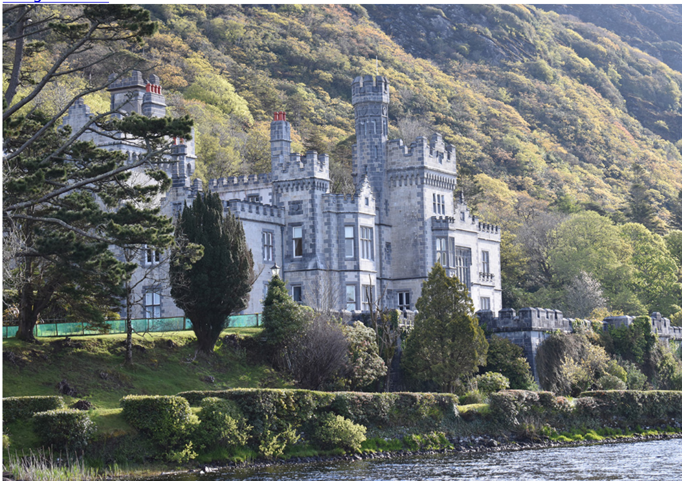
Kylemore Abbey in Connemara, Ireland