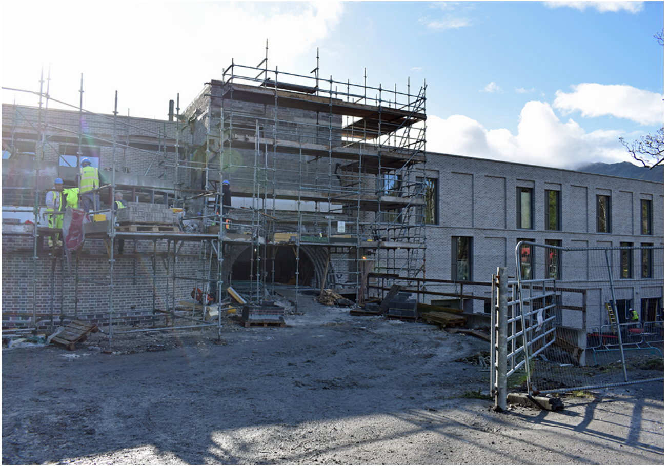
Workmen and scaffolding are still visible near the arched monastic entrance to the new monastery at Kylemore Abbey in the final weeks of construction. (Julie A. Ferraro)