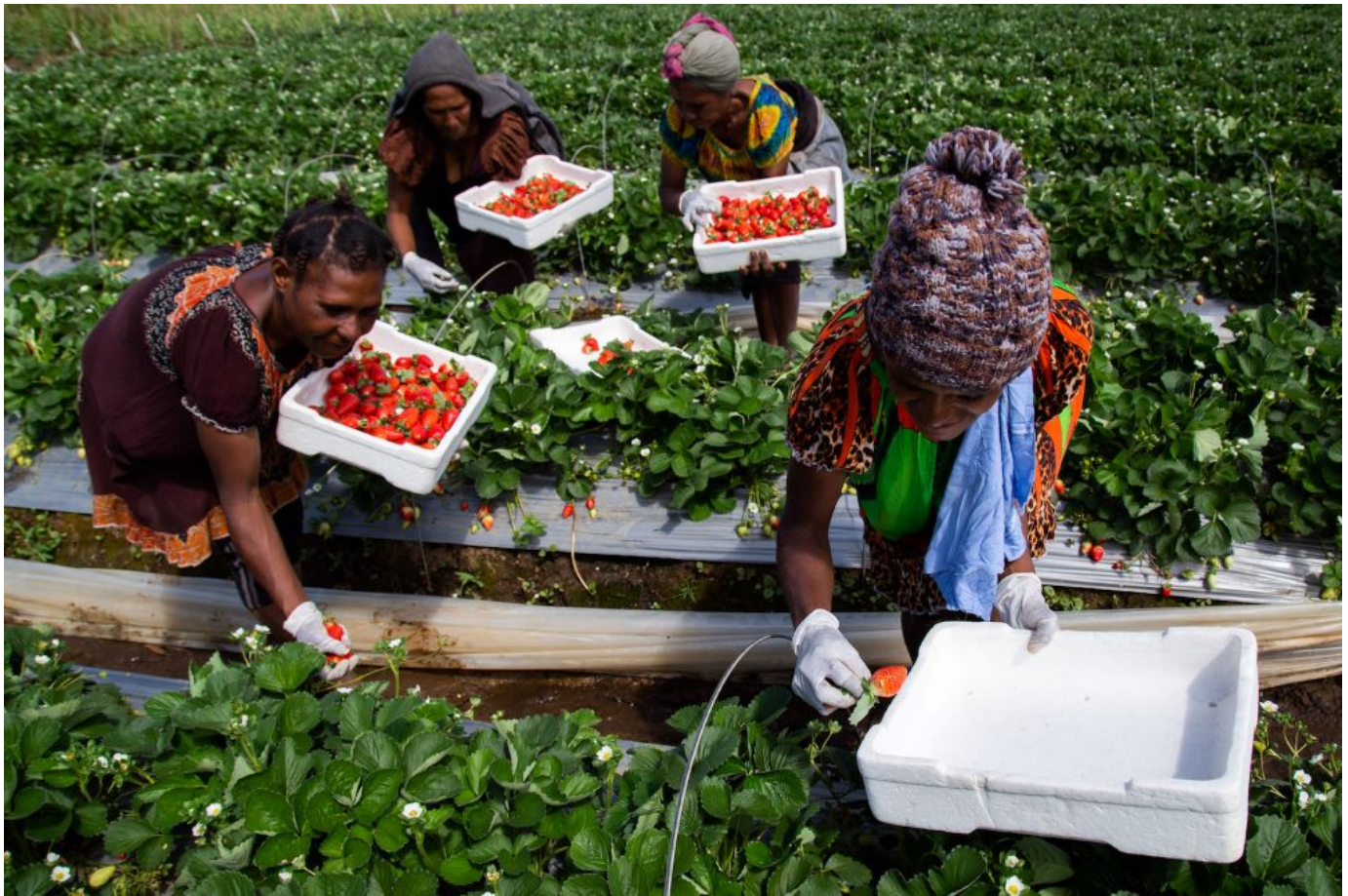
Women pick strawberries in a highland field in Enga Province, Papua New Guinea, in December 2019.

Like their mosquito hosts, Plasmodium parasites are sensitive to temperature . The two most common strains, Plasmodium falciparum and Plasmodium vivax, like temperatures in the range of 56 to 95 degrees Fahrenheit. The warmer the weather, the more quickly the parasites are able to reach their infectious stage. A study that examined temperatures suitable to Plasmodium in the western Himalaya mountains predicted that, by 2040, the mountain range's high-elevation sites — 8,500 feet above sea level — "will have a temperature range conducive for malaria transmission."