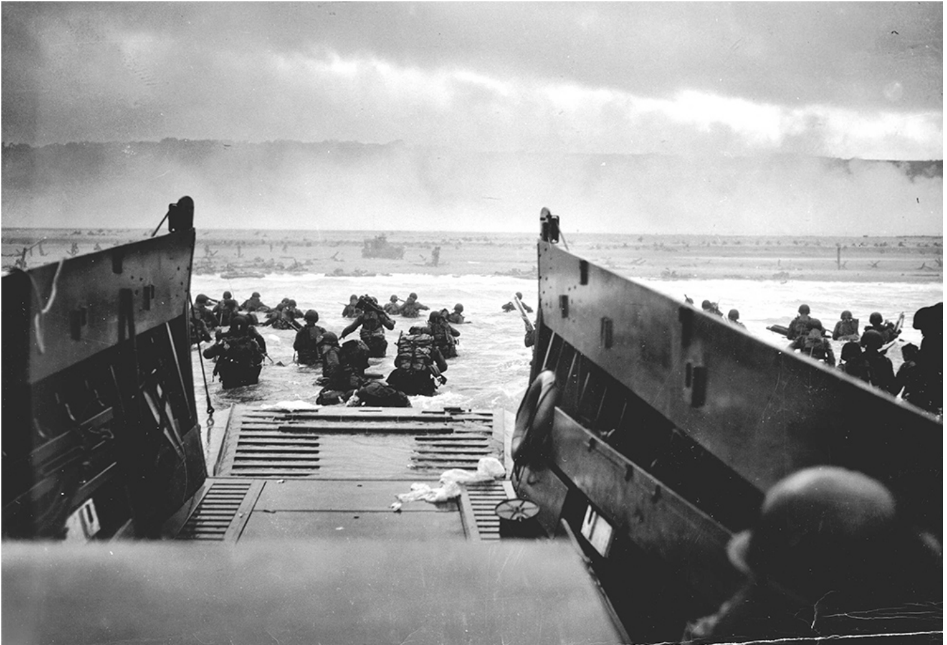
A LCPV (Landing Craft, Vehicle, Personnel) from the U.S. Coast Guard-manned USS Samuel Chase disembarks troops of the U.S. Army's First Division on the morning of June 6, 1944, (D-Day) at Omaha Beach.