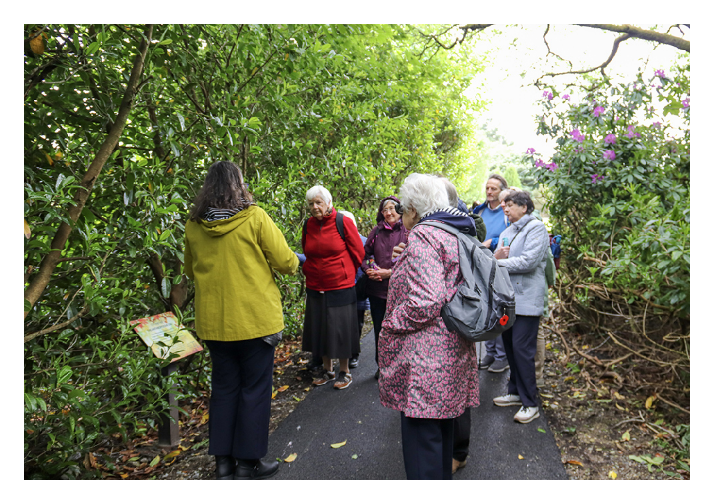
Visitors to Ireland's Knock Shrine are pictured on the newly launched Creation Walk, May 25, in Knock, County Mayo, Ireland. (Sinead Mallee)

The stations were designed by Grogan as standalone meditations or to be used with the companion booklet, <u>Creation Walk: The Amazing Story of a Small Blue Planet</u>. Grogan's booklet was written in 2020 and was meant to coincide with the launch of Knock's Creation Walk, but the COVID-19 pandemic scuttled those plans.