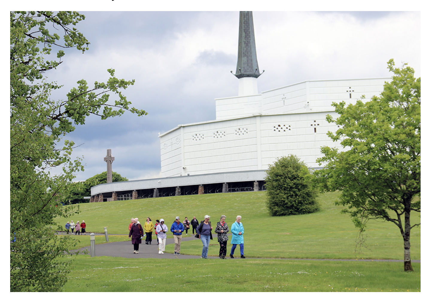
Visitors to Knock Shrine walk through the grounds.