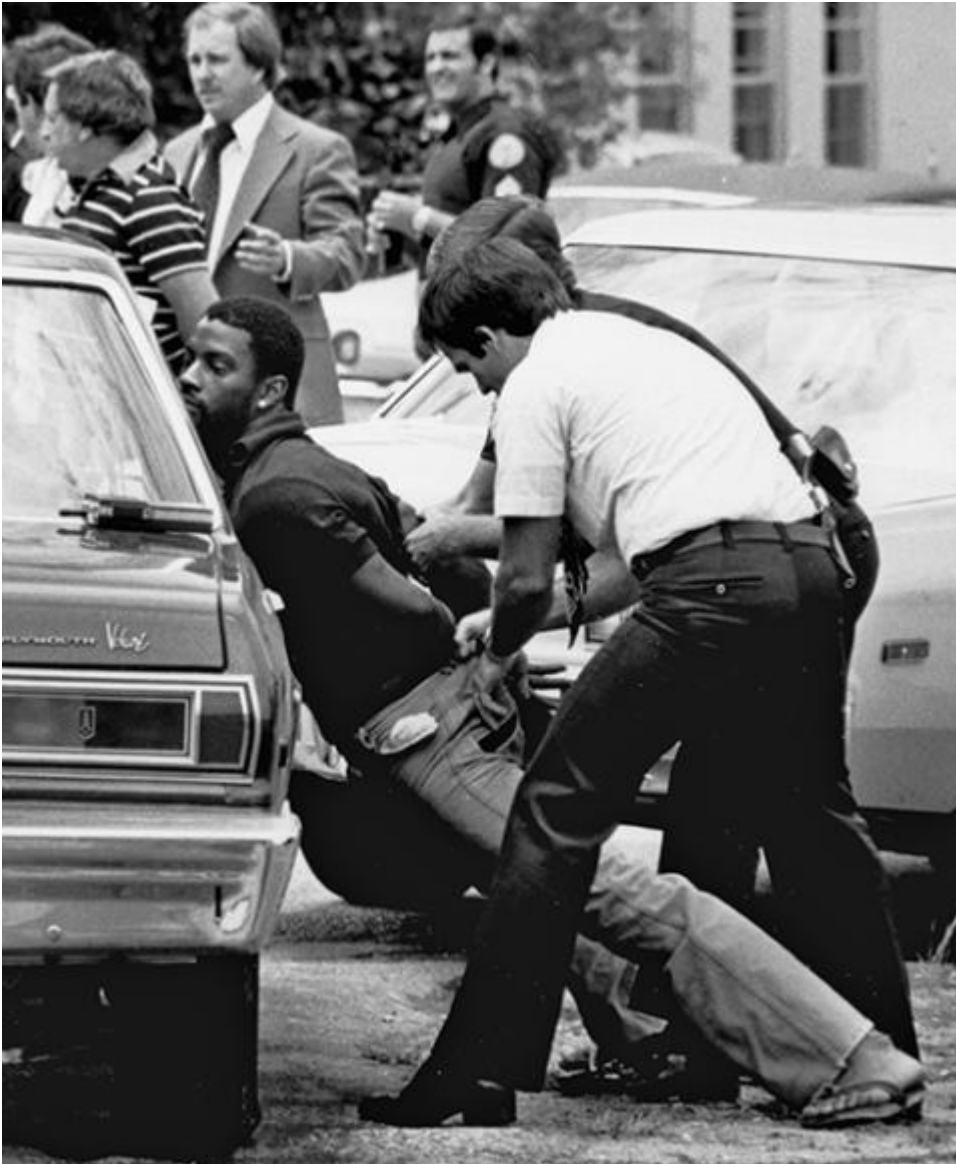
Police handcuff a suspect during a drug raid in Miami, May 18, 1979.

Regarding the disproportionate imprisonment of Black men, Harris points to the study " A Generational Shift: Race and the Declining Lifetime Risk of Imprisonment ," which found that during the period known as the "prison boom" (1973-2009), " 'the number of individuals incarcerated in prisons increased by more than 700%,' Black men born during 1981 and 1984 being most impacted, with one in three incarcerated."