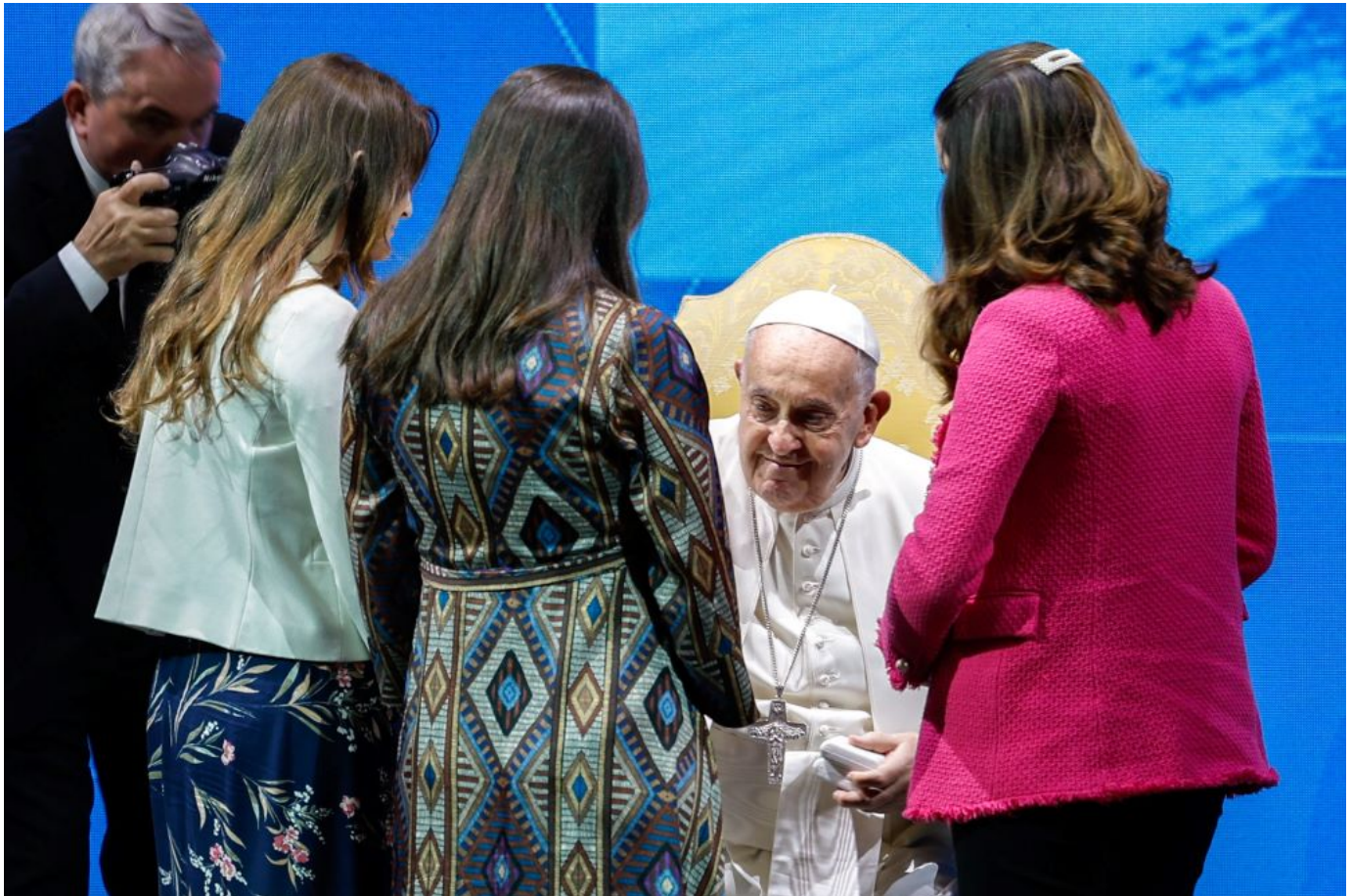
Pope Francis blesses three pregnant women at an annual meeting on Italy's declining birthrate at an auditorium in Rome May 10.