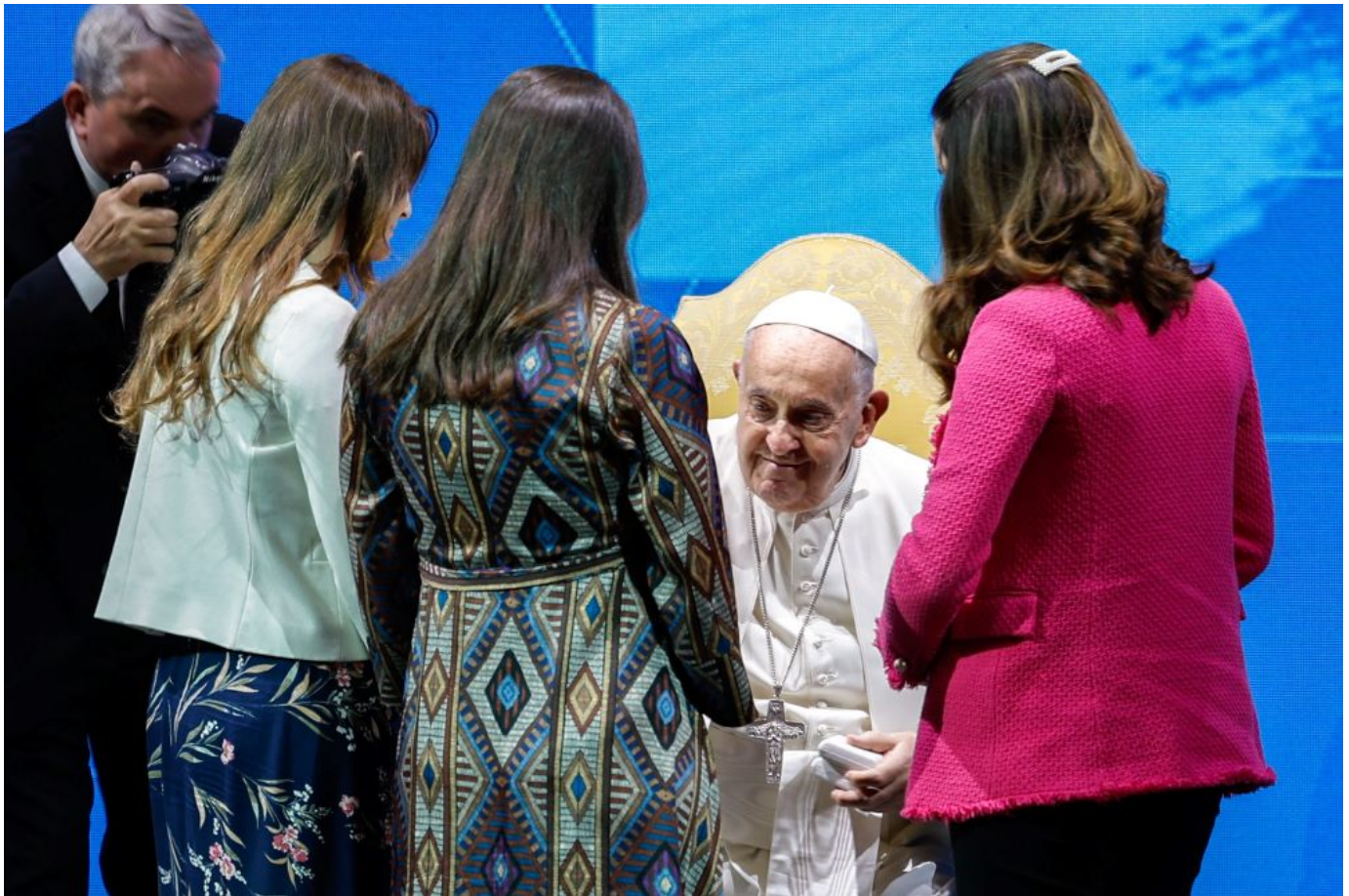
Pope Francis blesses three pregnant women at an annual meeting on Italy's declining birthrate at an auditorium in Rome May 10.