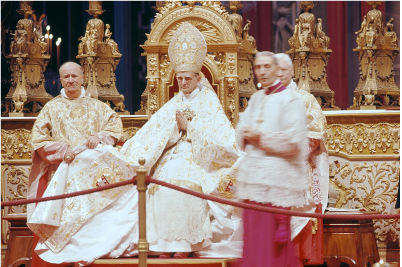
Cardinal Alfredo Ottaviani, left, stands next to Pope Paul VI, center, in this photo taken sometime between 1963-1965 during the Second Vatican Council.