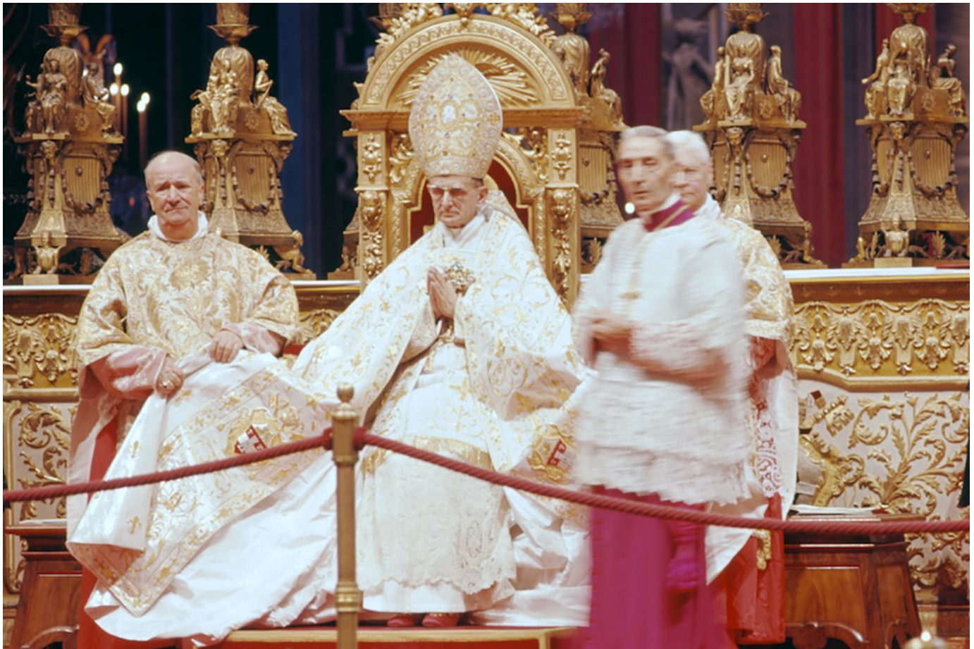
Cardinal Alfredo Ottaviani, left, stands next to Pope Paul VI, center, in this photo taken sometime between 1963-1965 during the Second Vatican Council.