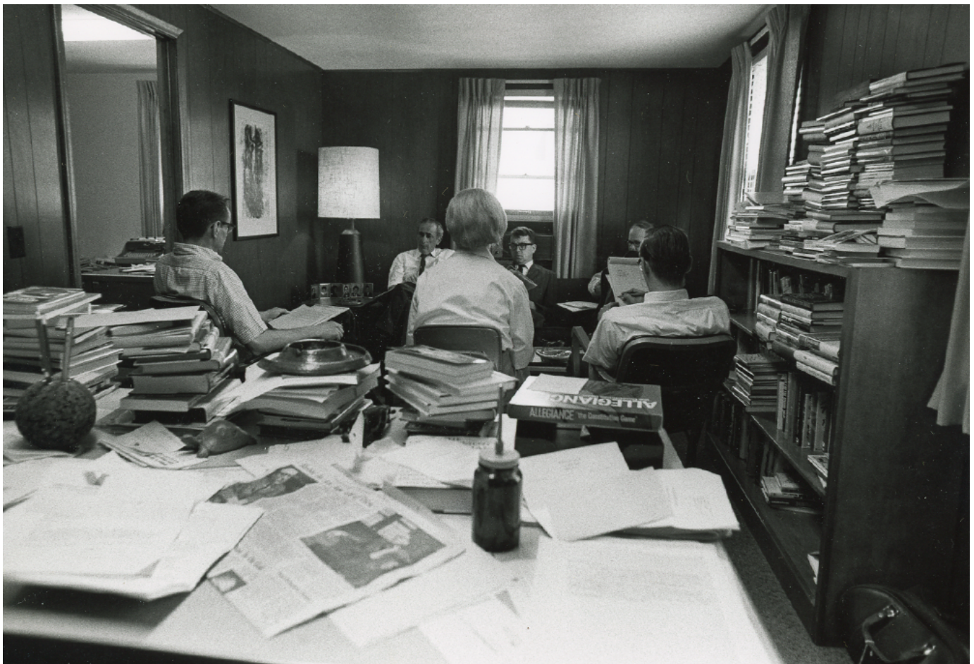
NCR staff are pictured inside the company's headquarters in Kansas City, Missouri, in this 1968 photo. NCR's first issue appeared in October 1964, amid the Second Vatican Council.

Understanding NCR's roots during those times is essential to understanding the fullness of the NCR journalism mission, the commitments of its staff and board of directors, and the power behind its endurance for nearly six decades now.