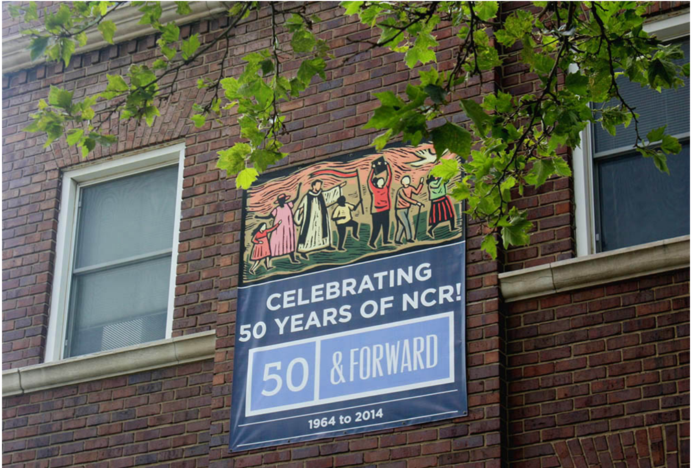
A banner celebrating the National Catholic Reporter's 50th anniversary is seen on the company's headquarters in Kansas City, Missouri.