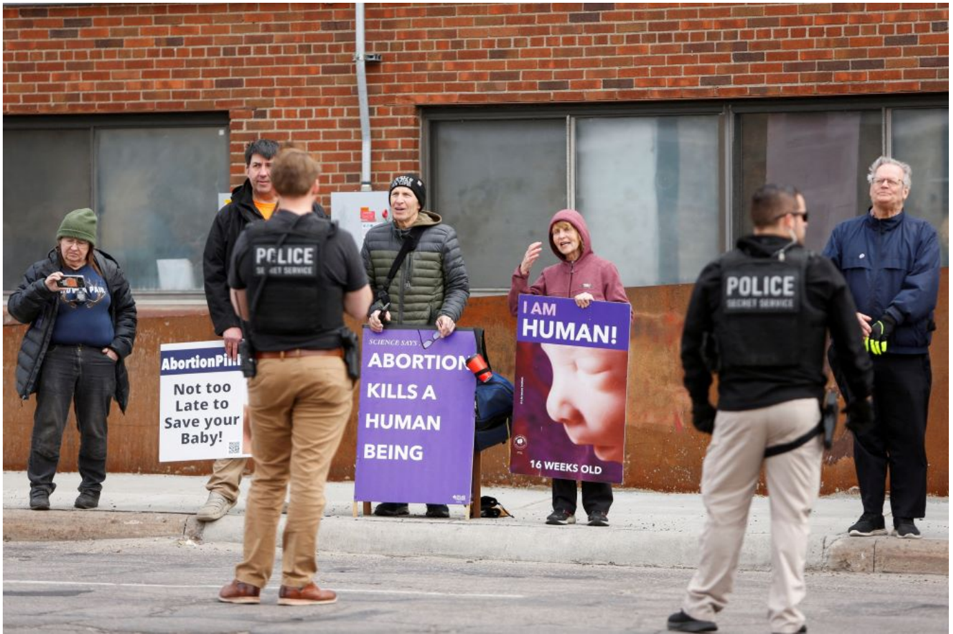
Abortion opponents demonstrate as U.S. Vice President Kamala Harris visits an abortion clinic in Minneapolis March 14.

But what about abortion? This is the argument I heard for years. No matter how terrible a Republican candidate was, we still had to support them, because of abortion. No matter how strong a Democratic candidate was on the economy, health care, just war, capital punishment, immigration or other life issues, we still had to oppose them, because of abortion. Today, some who identify as staunchly pro-life might still withhold support from Harris because of her position on reproductive health issues. And yes, Harris is very pro-choice and does plan to codify Roe v. Wade's protections into law.